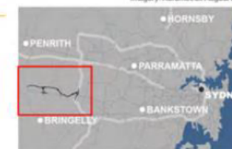
Figure 5-1 Project spoil haulage routes

Date: 04/04/2024 Path: C:\Users\gpc2279\My Computer\2024\04\04 - M12 Motorway GCSMP - 01\0000303606.2282_Maps Management\m12\0000303606.2282_M12_MW_COE_A4_16.aprx Created by: GC | QA by: RB