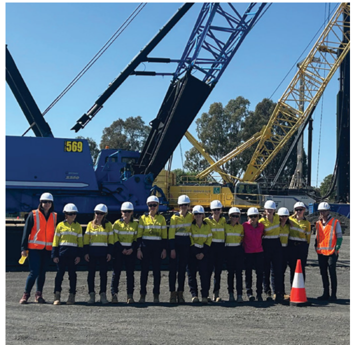
Sista's in Trade at the New Dubbo Bridge site on River Street

Funded by the Department of Employment and Workplace Relations, the Bamara Sista's in Trade program has successfully led to three permanent employment opportunities for participants within the New Dubbo Bridge Project.