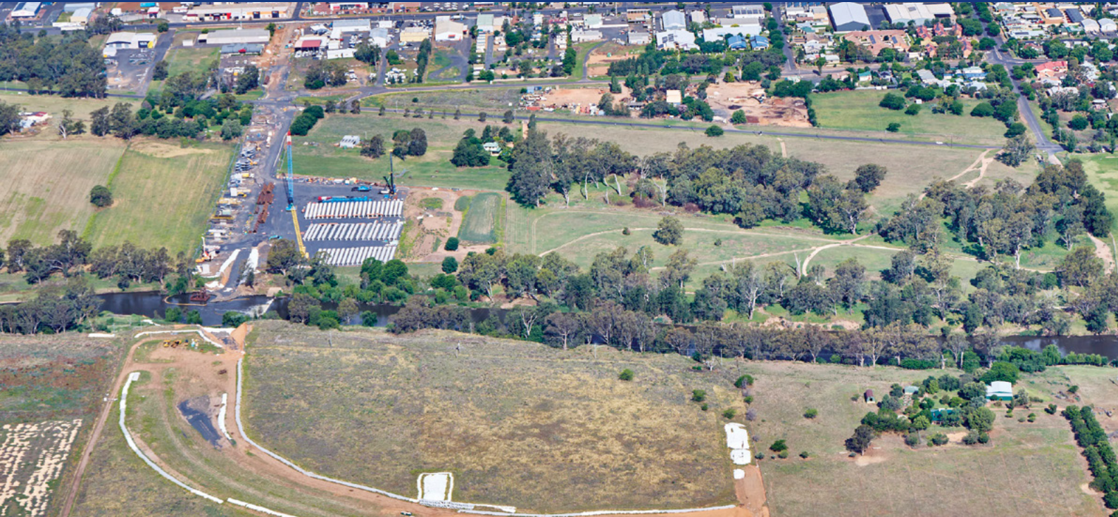
Aerial view of the New Dubbo Bridge project over the Macquarie River in Dubbo