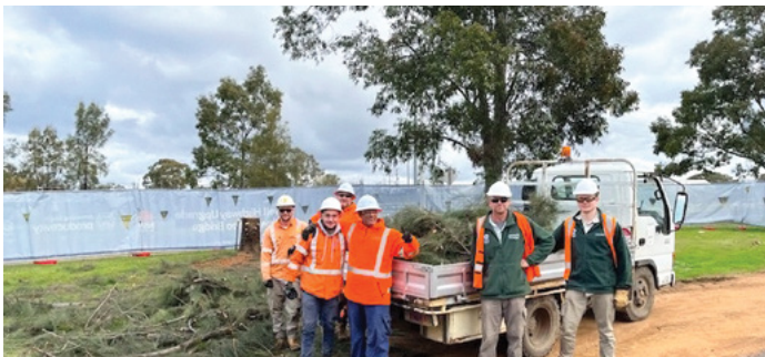
The project team with the branches being delivered to Western Plains Zoo

It's worth noting that Transport has previously partnered with Taronga Western Plains Zoo during the Upgrade of the Mitchell Highway between Dubbo and Narromine. We donated tree branches, trunks, and root balls, which were used as supplementary food for Elephants and Rhinos, as well as for landscaping within the zoo grounds.