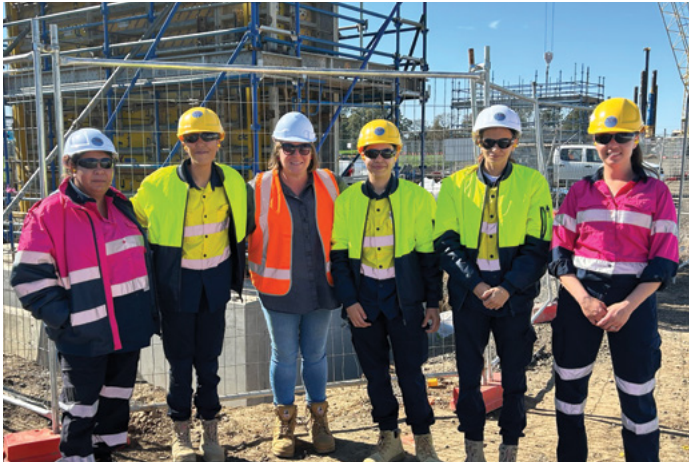
Girls Can Too at the New Dubbo Bridge site

During their industry day at the New Dubbo Bridge, the students received an introduction to the project, participated in an induction, enjoyed a site tour, and wrapped up the day with an exciting and competitive bridge-building competition!