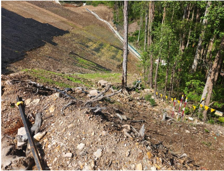
Image 5: Southern Interchange looking north to the permanent landscaping works, with the sediment basin behind the trees.