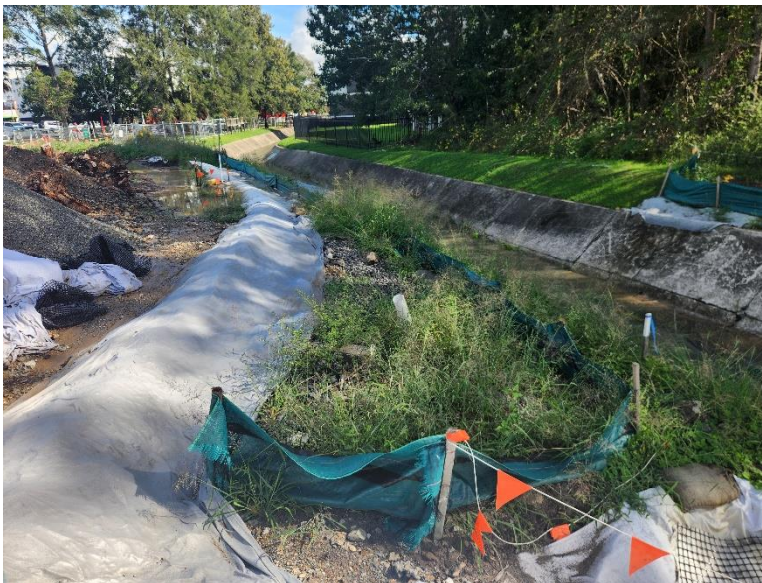
Image 3: Northern Interchange, view of the works on the Northern side of Dark Creek, behind McDonalds.