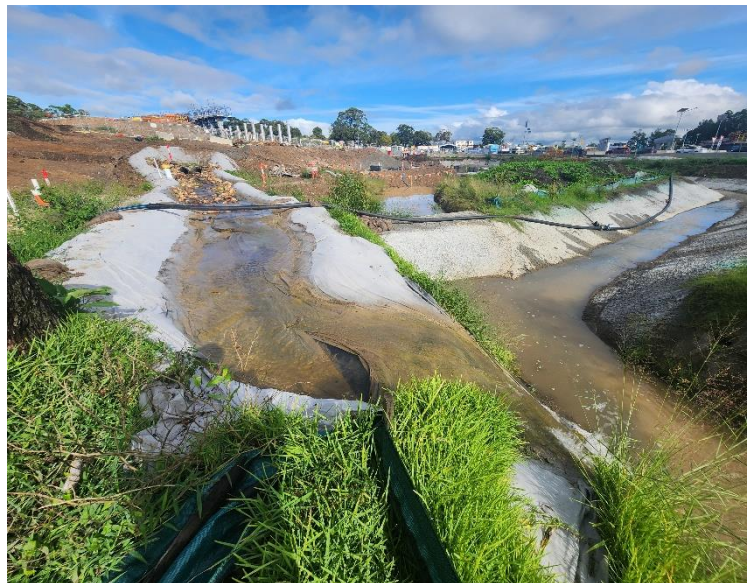
Image 4: Northern Interchange, the realigned Dark Creek culvert works with a clean water diversion in place.