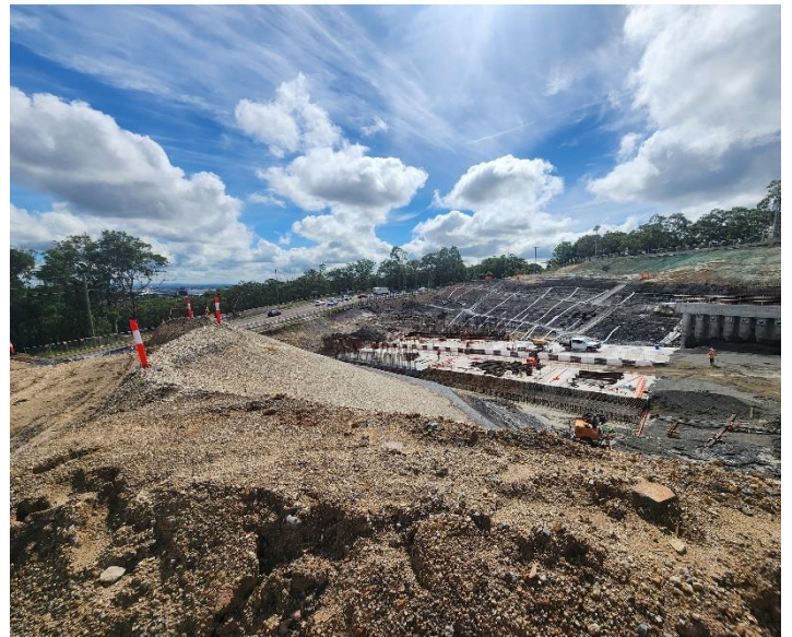
Image 8: Southern Interchange at the corner of McCaffrey Drive and Lookout Road. Concrete footings for large vehicle culvert.