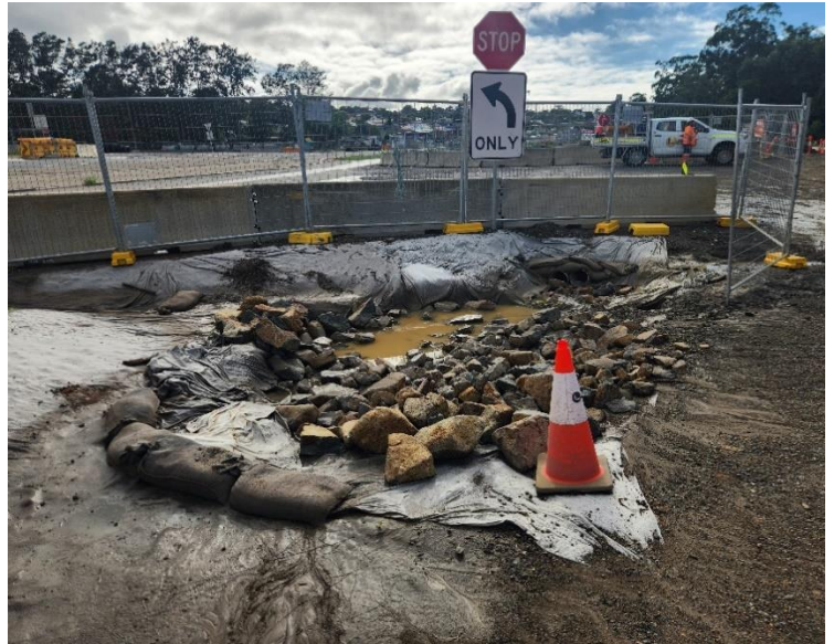
Image 2: Northern Interchange, view of the entry to the compound and site.