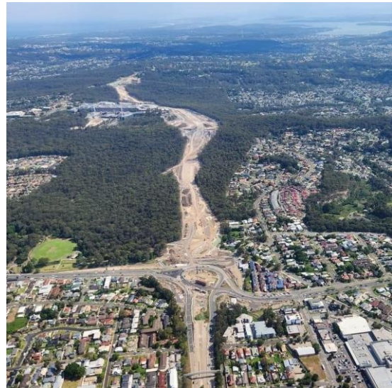
Photo: Aerial photo looking south

This Environmental Representative (ER) Monthly Report is prepared in accordance with the Minister's Condition of Approval A26(k) for the Newcastle Inner City Bypass: Rankin Park to Jesmond (SSI-6888) and is consistent with the Environmental Representative Protocol (October 2018).