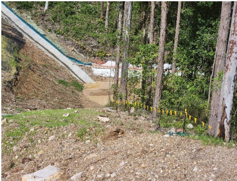
Image 7: Southern Interchange, at the bottom of the permanent landscaping works including sediment basin.