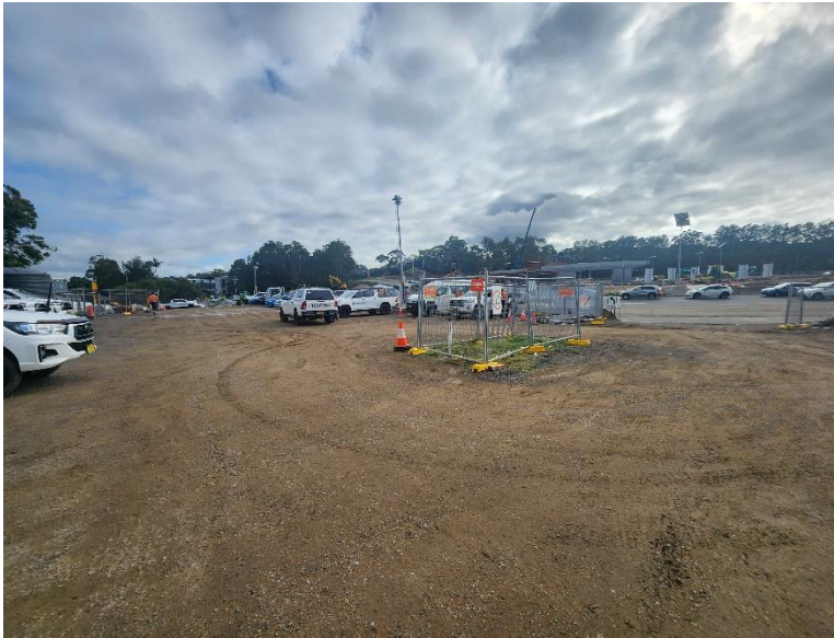
Image 1: Northern Interchange, Jesmond compound adjacent to Newcastle Road.