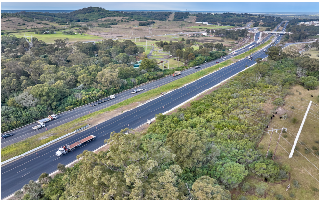
Motorists driving on the Hume Motorway looking south at the new bridge.