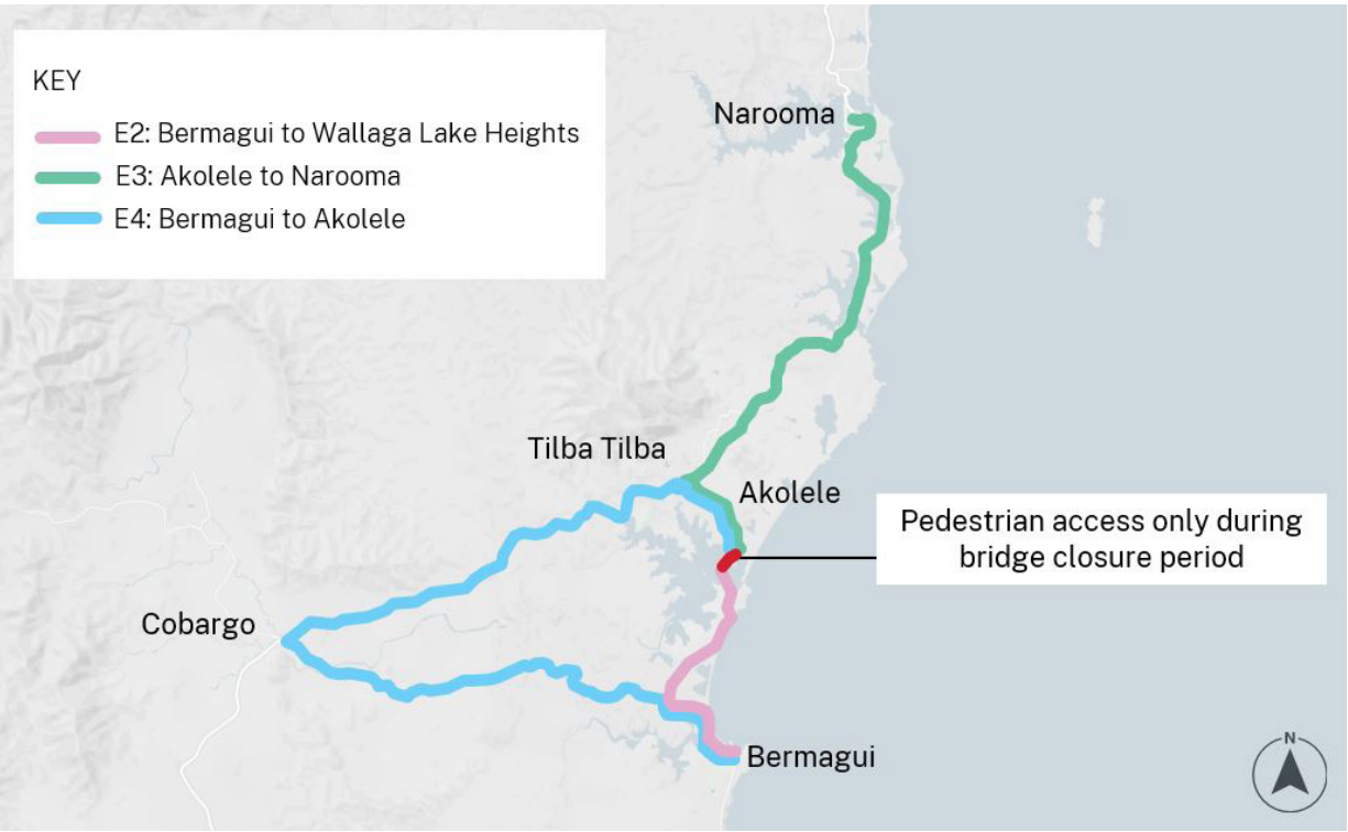
Free temporary bus service routes

While the timetable and route map is available at transportsw.info and the project website, printed copies of the timetable will be available at the following locations for the community to collect: