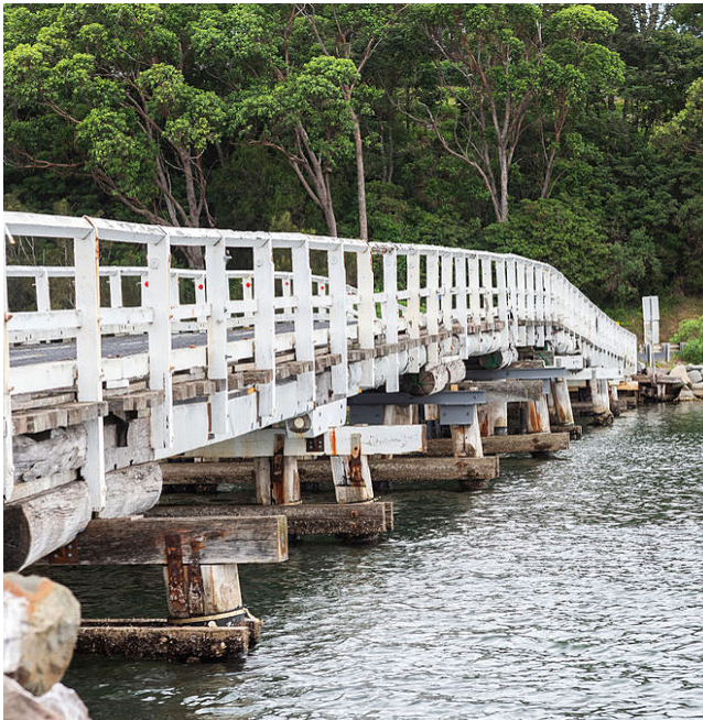
Wallaga Lake Bridge

"The [bus] timetable is excellent, with availability at important times" - local resident