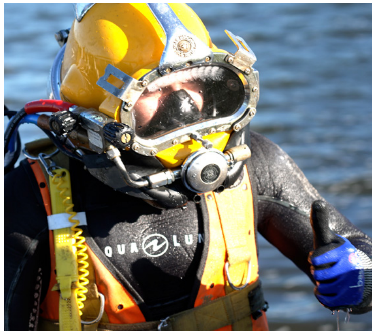
A diver surfaces after carrying out work underwater during the first closure

If you have any questions or concerns, please contact the project team.