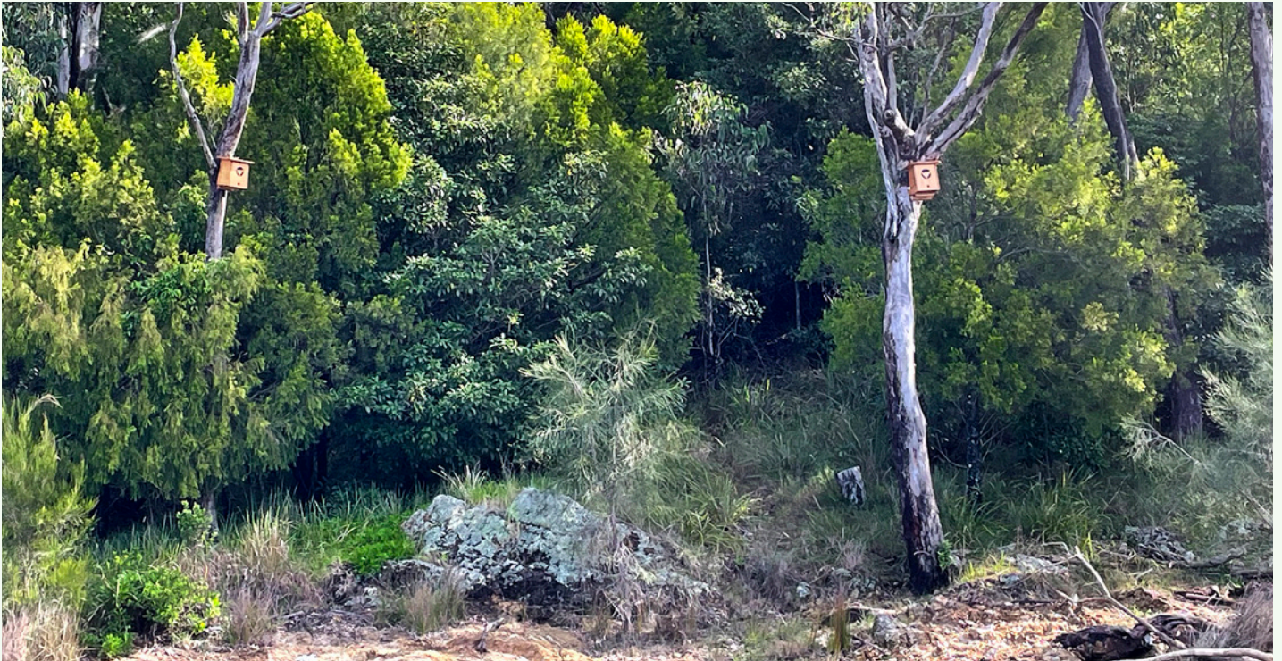
Nest boxes provided for the microbats

The microbat colony will be monitored during the next stage of work and for up to 12 months after the completion of work.