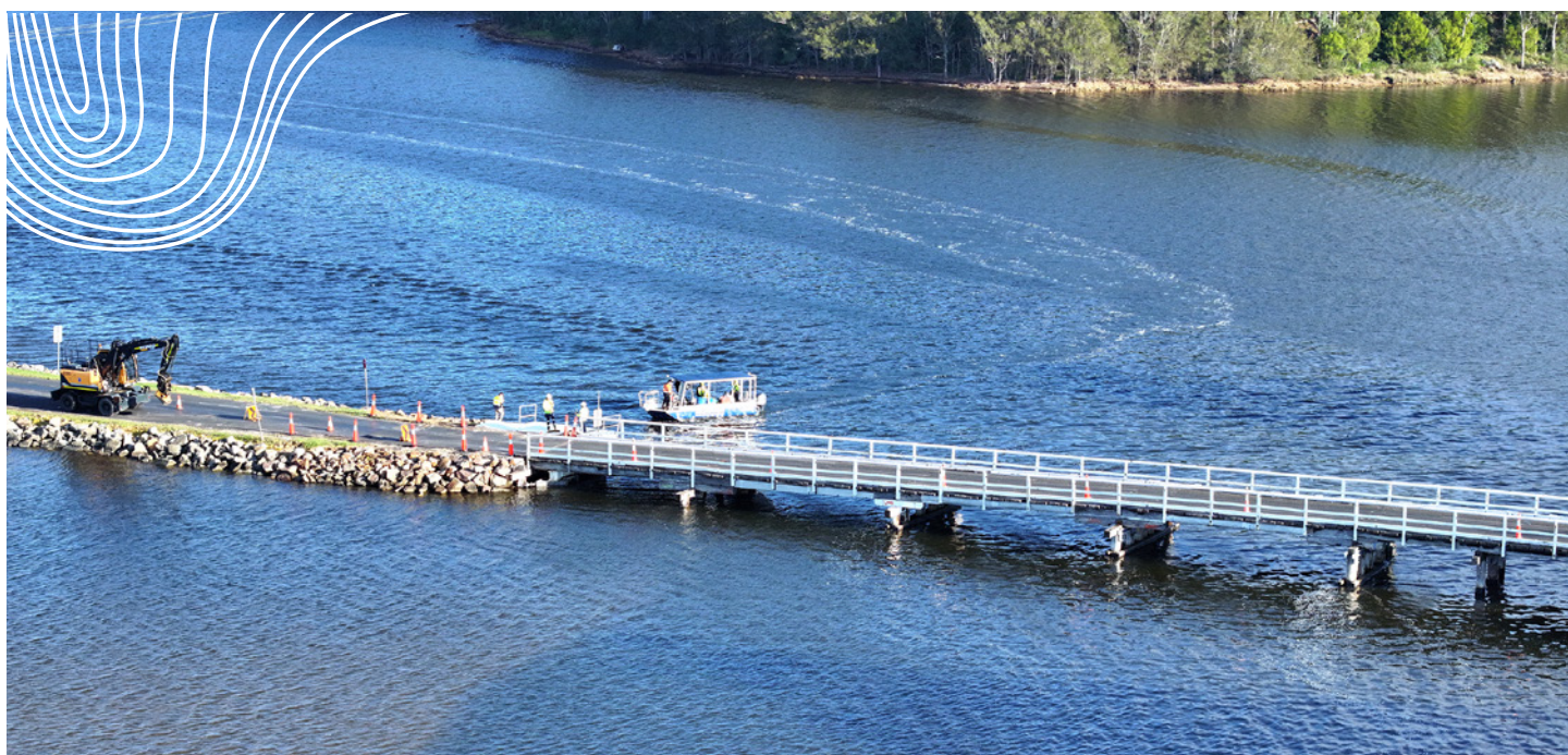
Aerial view of Wallaga Lake Bridge