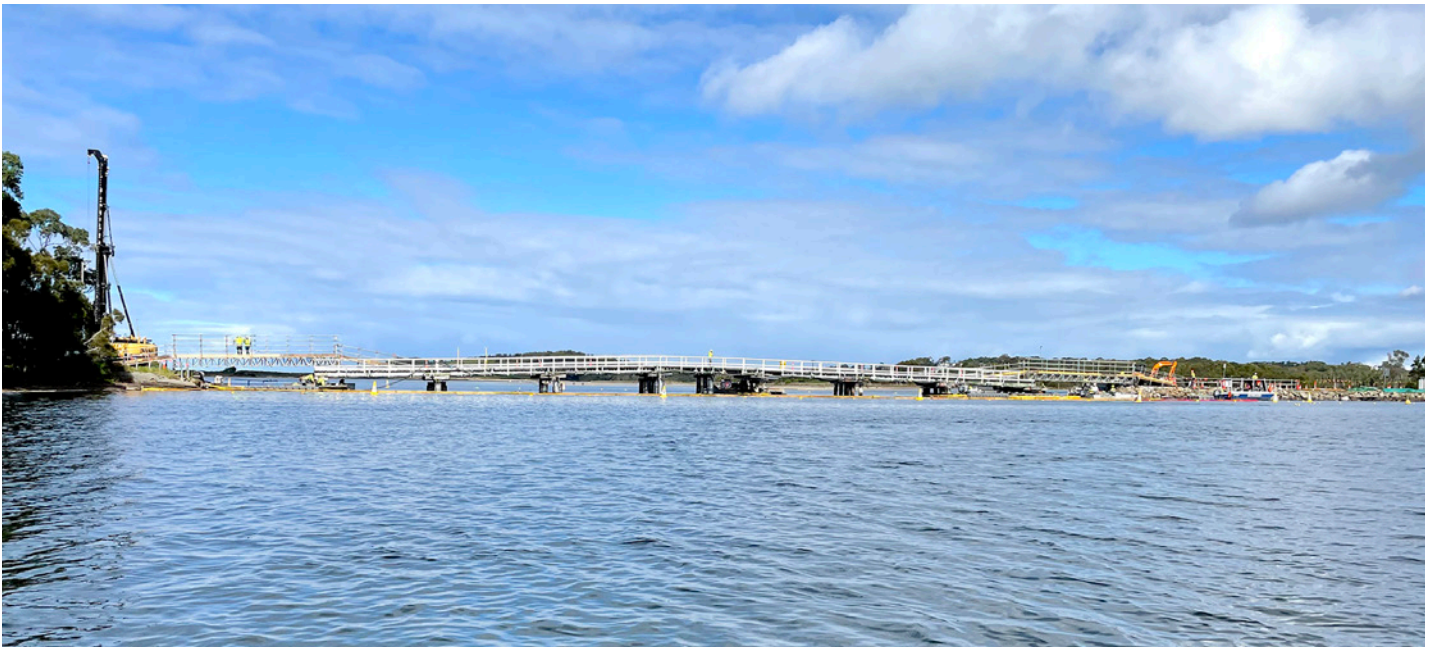
Looking east towards Wallaga Lake Bridge