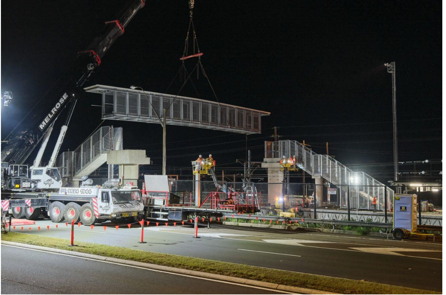
Pictured: A 450-tonne crane positioned on the Princes Highway, lifting in a 25-metre long, precast footbridge in March 2024.