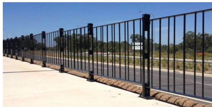
Example of the pedestrian fencing that will be installed at Blaxland

To accommodate these improvements, we need to remove 25 metres of parking within the project footprint on the Great Western Highway. However, we will retain 25 metres of kiss and drop parking along with a 30-metre bus stopping bay. The kiss and drop zone will be closed during night construction hours.