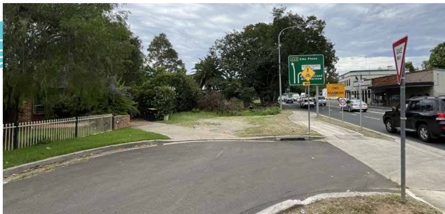
Great Western Highway at Billington Place, Emu Plains

Transport for NSW is working towards improving customer experience, accessibility and safety, as part of the Bus Priority Infrastructure Program