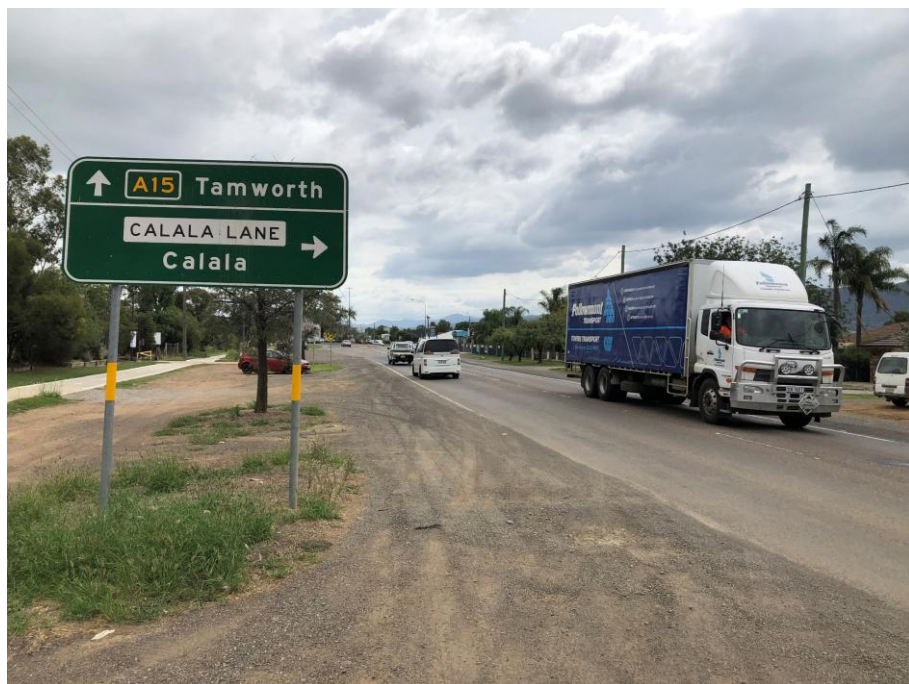
Looking north towards Calala Lane

The community will be informed as each stage of planning work progresses, including the opportunity to comment on the proposed design.