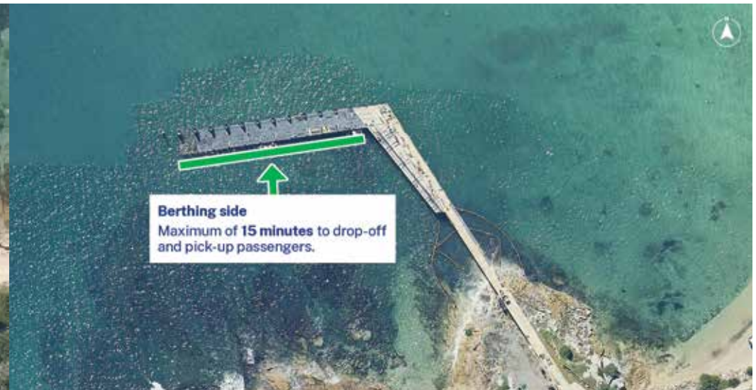
Berthing location at Kamay Wharf La Perouse