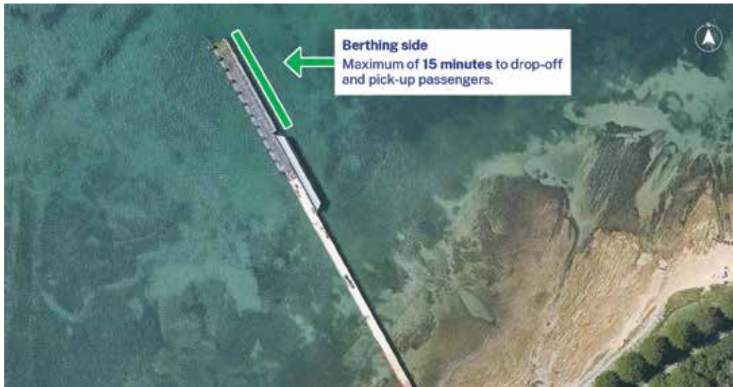
Berthing location at Kamay Wharf Kurnell