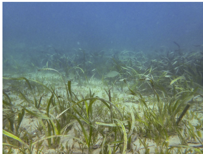
Image above: seagrass and fish in restoration site Scar E at Kurnell, taken in December 2024.

You can view the seagrass monitoring report on the project documents webpage (scroll to: 'Marine biodiversity offsets and reporting', and then 'Monitoring reports', 'seagrass translocation, rehabilitation and monitoring report 5').