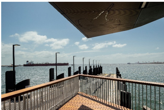
Kamay Wharf Kurnell.

You can find more information on wharf safety and operation on our website .