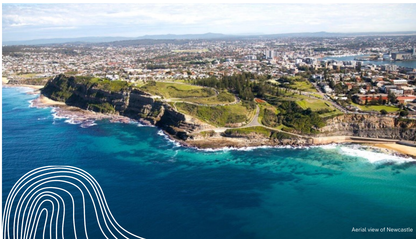
Aerial view of Newcastle

Transport for NSW has confirmed a preferred location for a future transit corridor that will connect Newcastle Interchange with the Broadmeadow precinct.