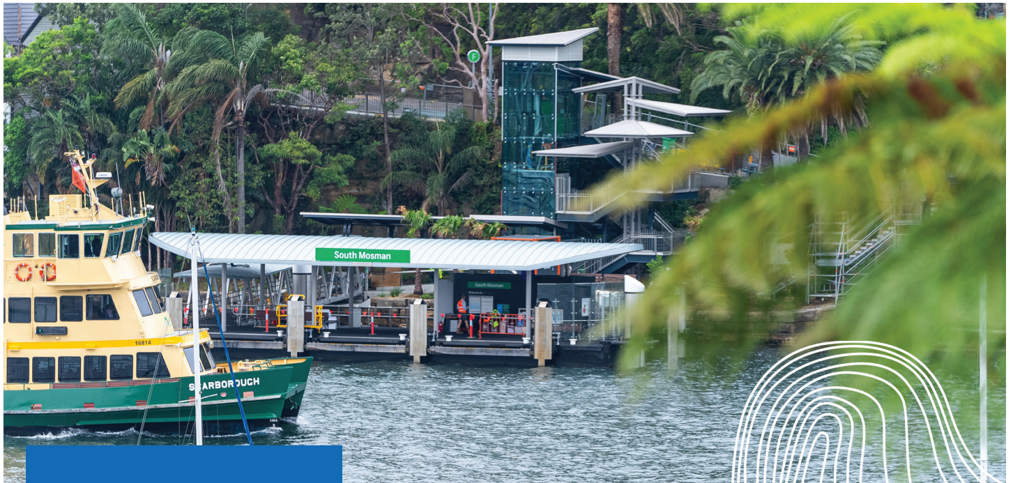
View of the new South Mosman Wharf