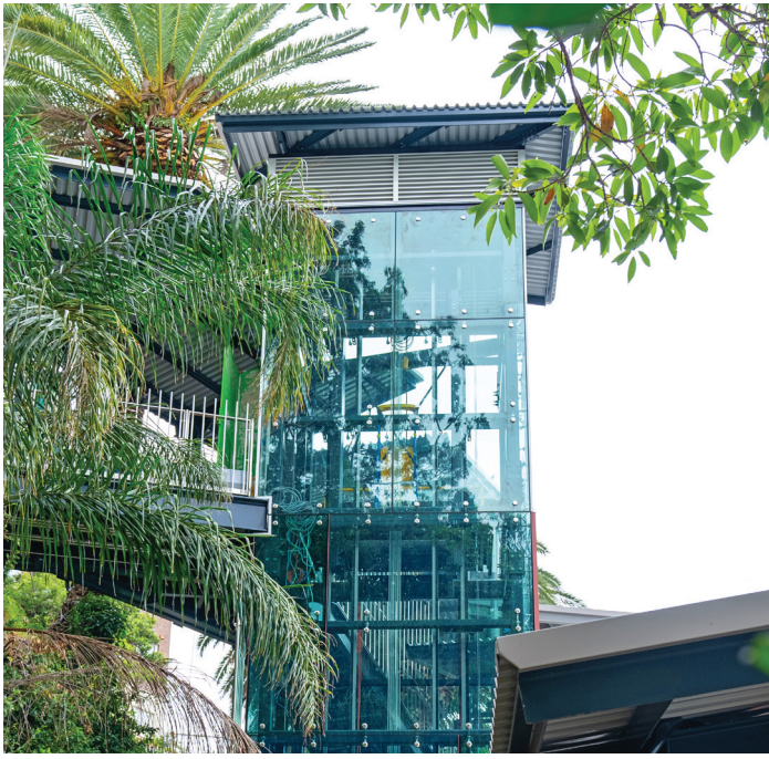
View of the new South Mosman Wharf lift