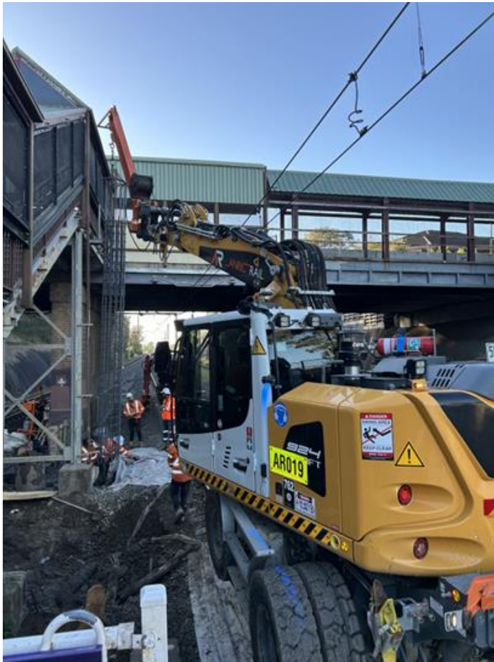
Image: Construction activities in May 2025