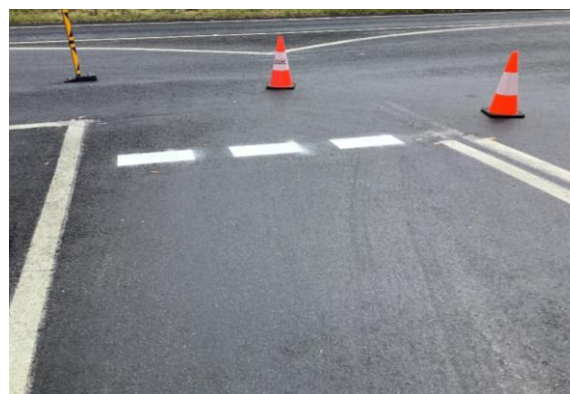
Figure 1. adding a hold line on Valla Beach Road