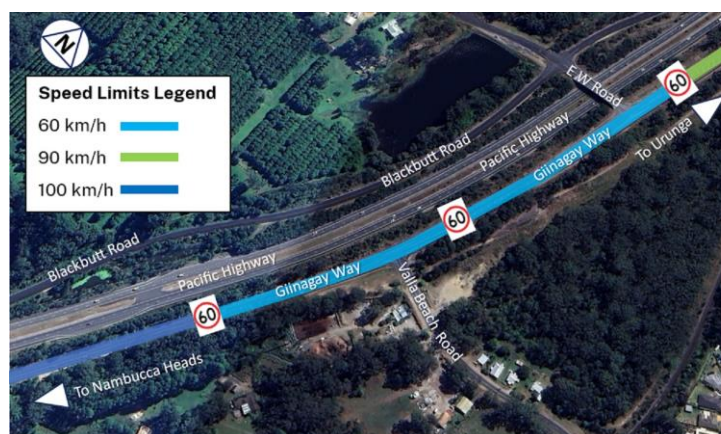
New speed limit changes at the Giinagay Way and Valla Beach Road intersection

Variable Message Boards have been installed to notify road users of the new speed limit and permanent 60km/h speed limit signs will be installed in the coming weeks.