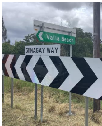
Figure 4. enhanced signage