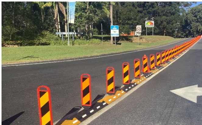
Figure 3. installing traffic separators