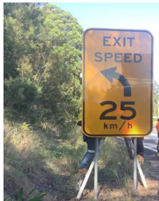
Figure 5. 25km/h exit sign