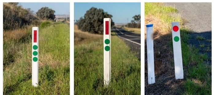
Green reflectors are installed on guide posts to provide advance warning for drivers.

Green reflectors mounted on roadside guide posts are used as a simple, cost effective way of assisting heavy vehicle drivers to more easily identify an appropriate informal heavy vehicle stopping opportunity.