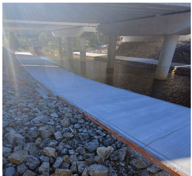
New fauna crossings along Williams Creek – view from below