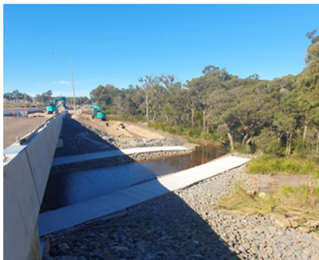
New fauna crossings along Williams Creek – view from above