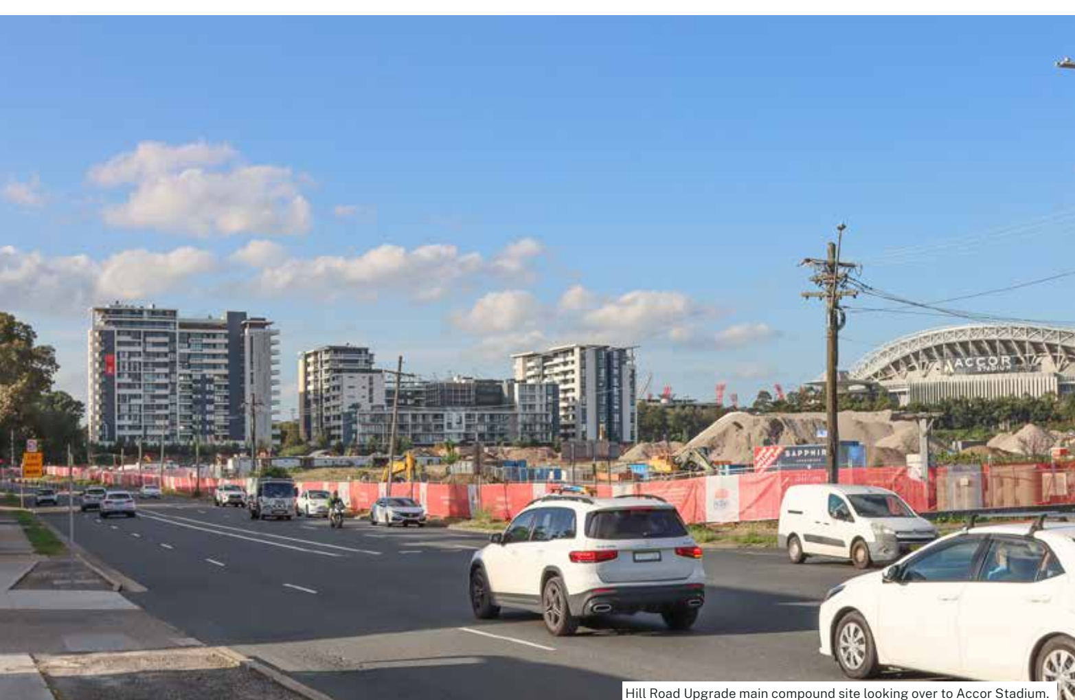
Hill Road Upgrade main compound site looking over to Accor Stadium.