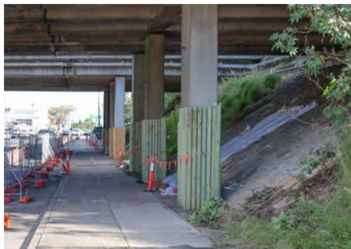
Utilities work progressing under the M4 Western Motorway.