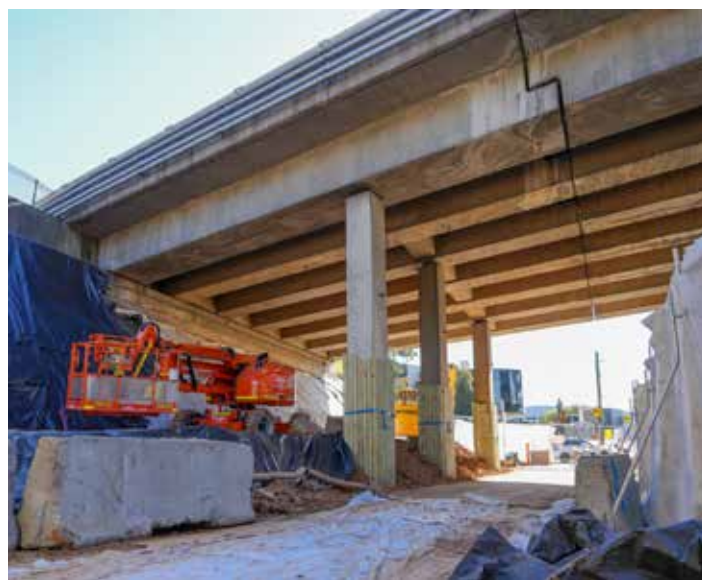
Utilities work progressing under the M4 Western Motorway.