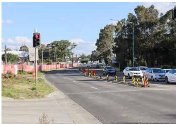
Hill Road and John Ian Wing Parade intersection.