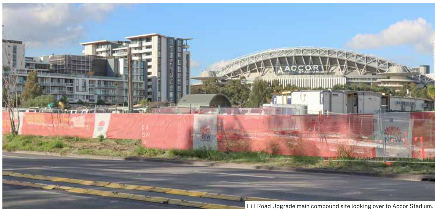
Hill Road Upgrade main compound site looking over to Accor Stadium.

Transport for NSW acknowledges the Dharug people as the Custodians of the lands on which we work and pays respect to Elders past and present.