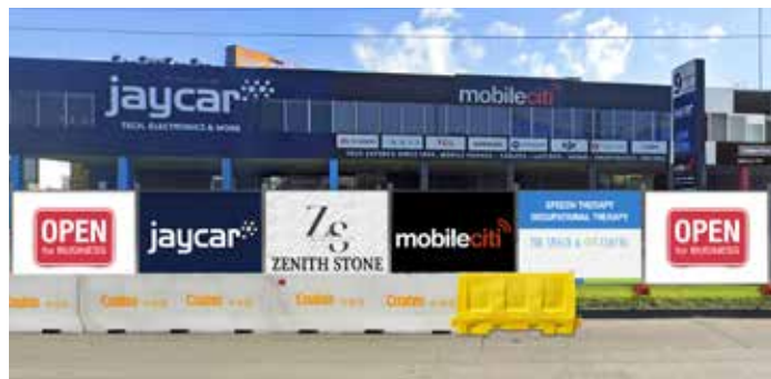
Businesses support along Parramatta Road.

We are working in collaboration with businesses at 9 Parramatta Road including: Jaycar Electronics; Mobileciti; Zenith Stone and the Speech & OT Centre to install clear signage so customers know it's business as usual. This promotional support aims to keep businesses visible and accessible.