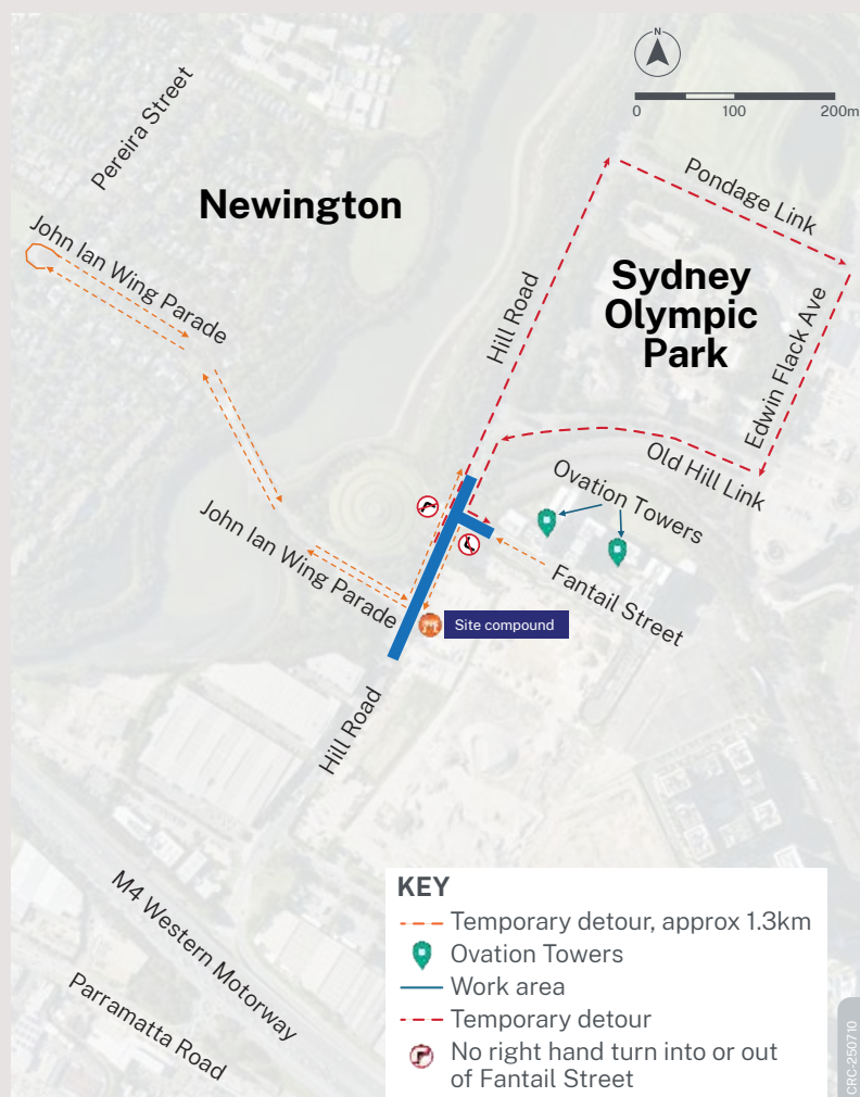
Vehicle detours for Fantail Street access to and from Hill Road.

We recognise these changes can impact the local community. Please allow for additional travel time when planning your journey. Transport thanks the community for their patience while we complete this important work.