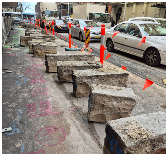
Kerb on King Street to be reinstated

This kerb was previously removed and is being reused where possible to preserve the street's heritage character.