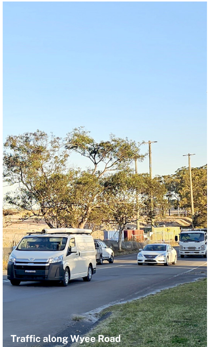
Traffic along Wyee Road

Subject to project approvals and release of funding, construction is expected to start in 2026.