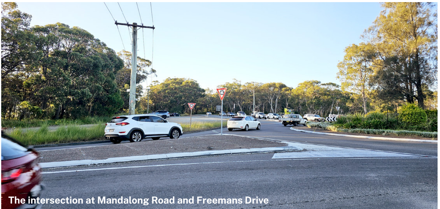
The intersection at Mandalong Road and Freemans Drive

A Review of Environmental Factors (REF) has been prepared and published for the Mandalong Road upgrade to identify potential impacts and proposed mitigation measures.