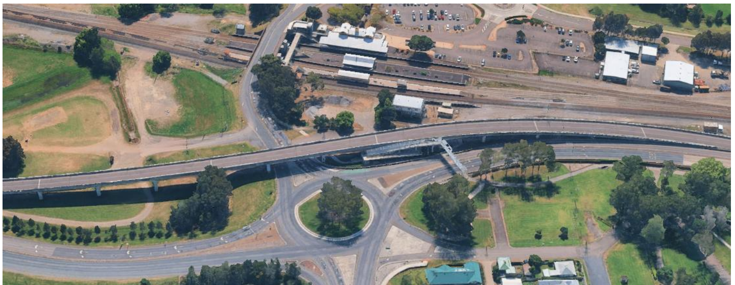
Aerial view of the New England Highway at Maitland, showing the eastbound flyover and westbound roundabout at Cessnock Road.

Transport for NSW is working with the Federal Government to expedite the construction of an overpass to improve this important intersection.