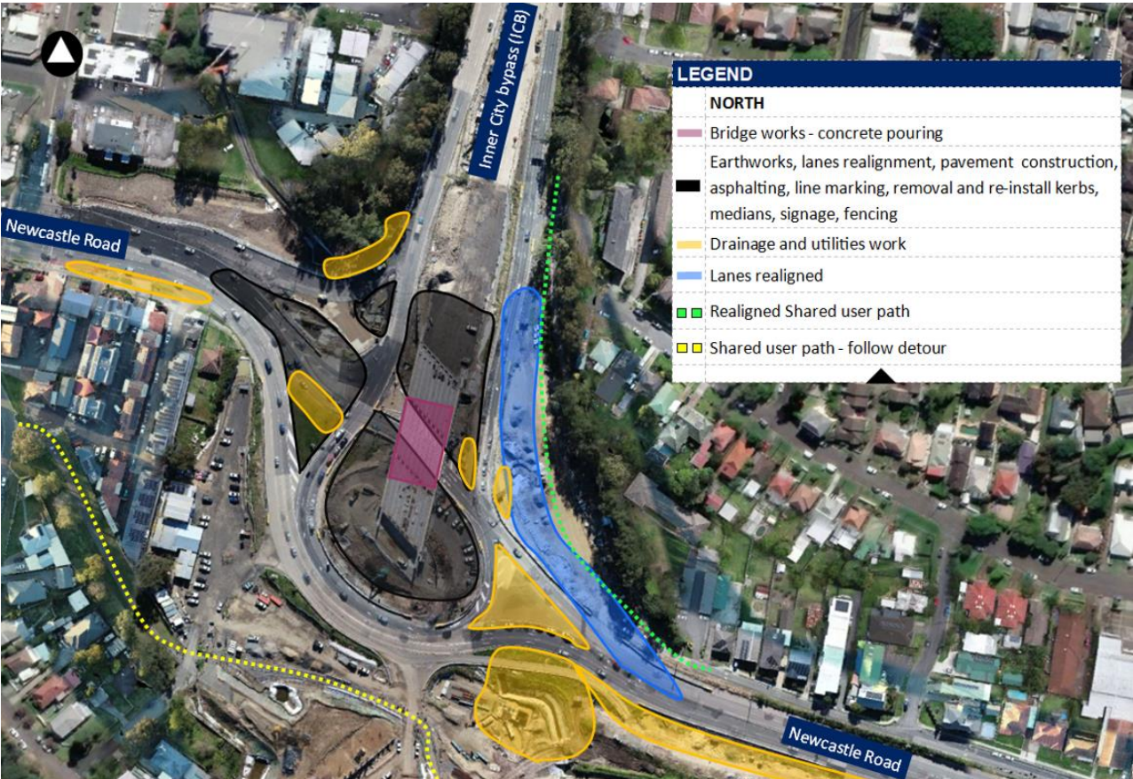
This is an artist impression only and is not to scale.