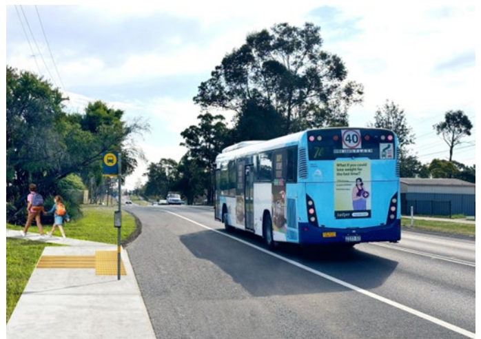
Artist impression of the proposed bus bay