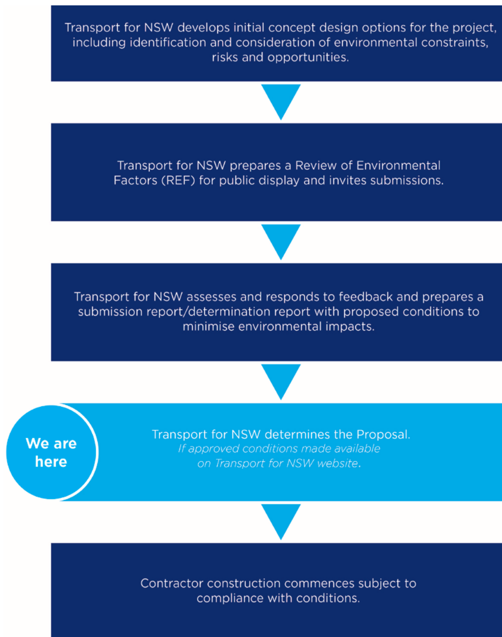
Figure 1: Planning approval process

Prior to proceeding with the Proposed Activity, the Secretary for TfNSW must make a determination in accordance with Part 5 of the EP&A Act (refer Figure 1).