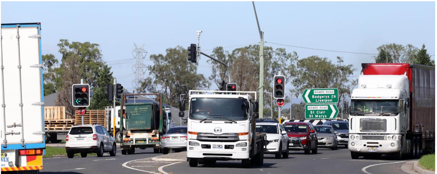
Traffic congestion at the existing intersection of Mamre Road and Erskine Park Road

The NSW Government is planning to upgrade Mamre Road between the M4 Motorway, St Clair and Erskine Park Road, Erskine Park to reduce congestion and improve safety and travel times.