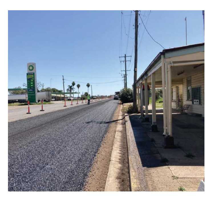
Temporary pavement construction at Bellata.