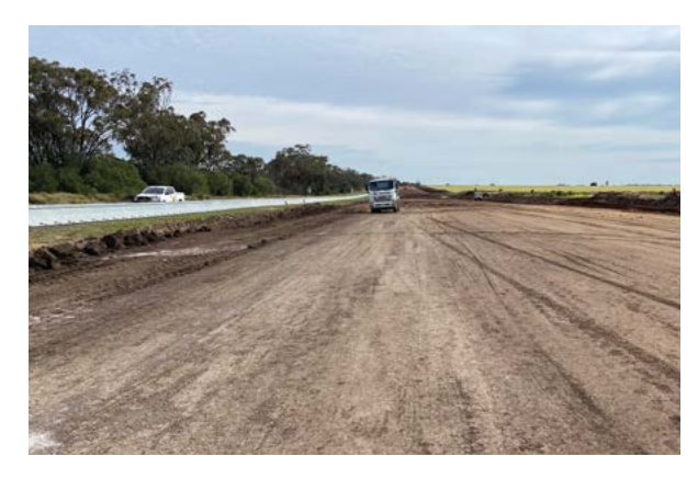
Stabilised foundation treatment, Section 3 near Bellata.