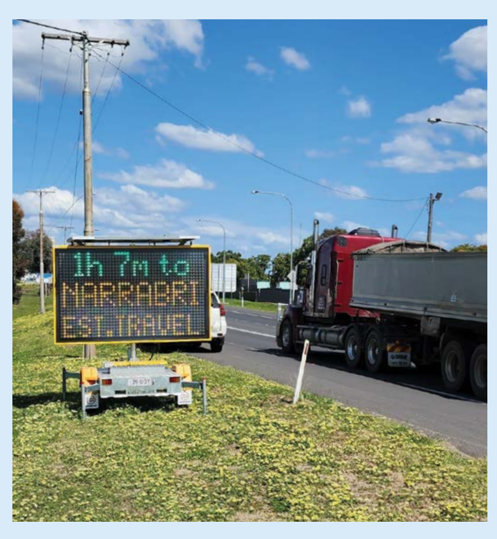
Variable Messaging Signs on the Newell Highway showing estimated travel time between Narrabri and Moree.

For the latest traffic updates download the Live Traffic NSW App, visit the Live Traffic website or call 132 701 .