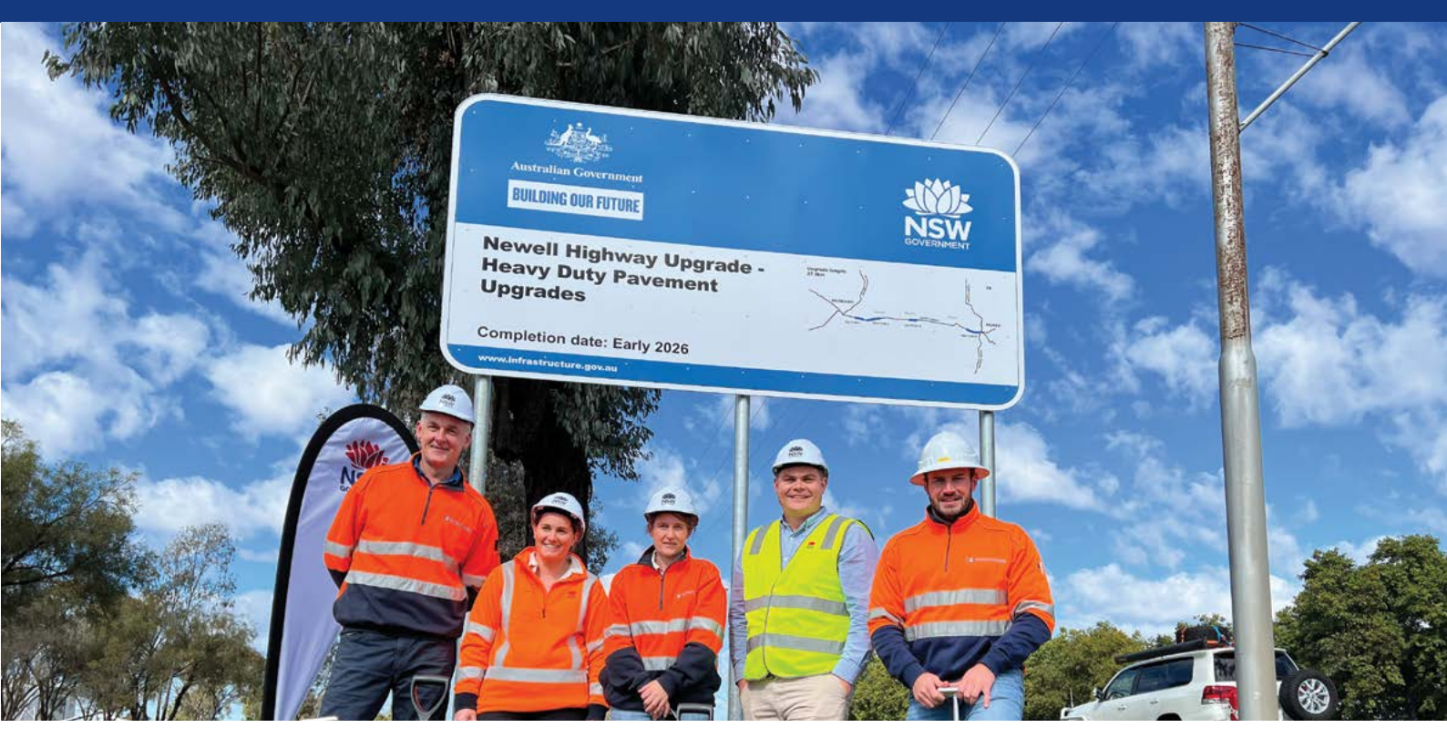
Transport for NSW and Fulton Hogan project teams pictured at the start of work announcement near Moree.