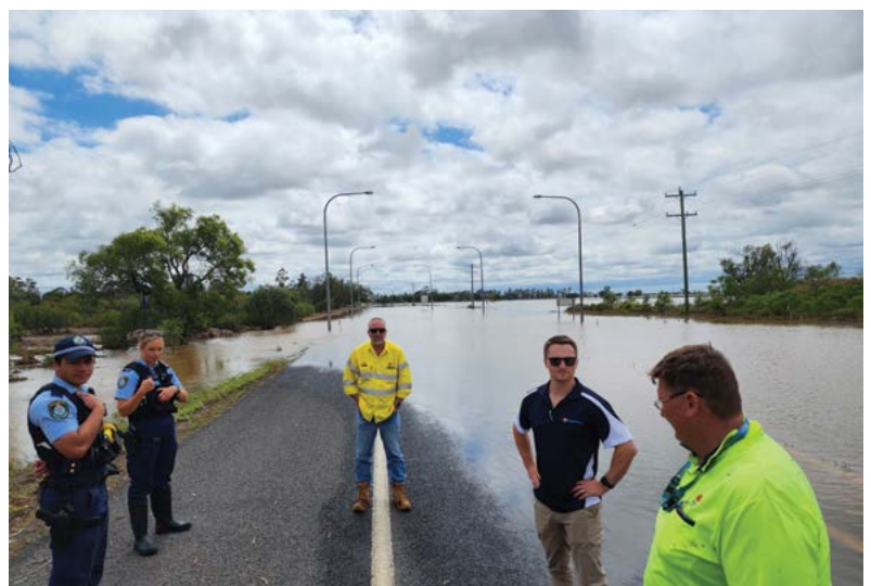
Transport and Fulton Hogan crews inspecting the flooding in Moree with emergency services.