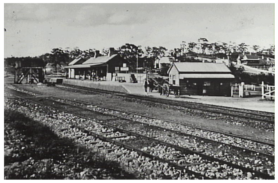
Figure 3 "Blackheath Railway Station" (n.d. - prior to 1898).