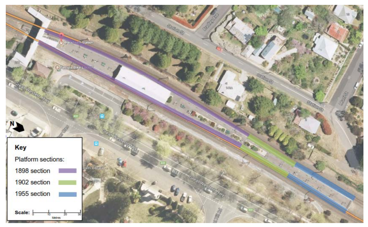
Figure 11 Plan sketch showing the changes in platform coping types (1898, 1902 and 1955)