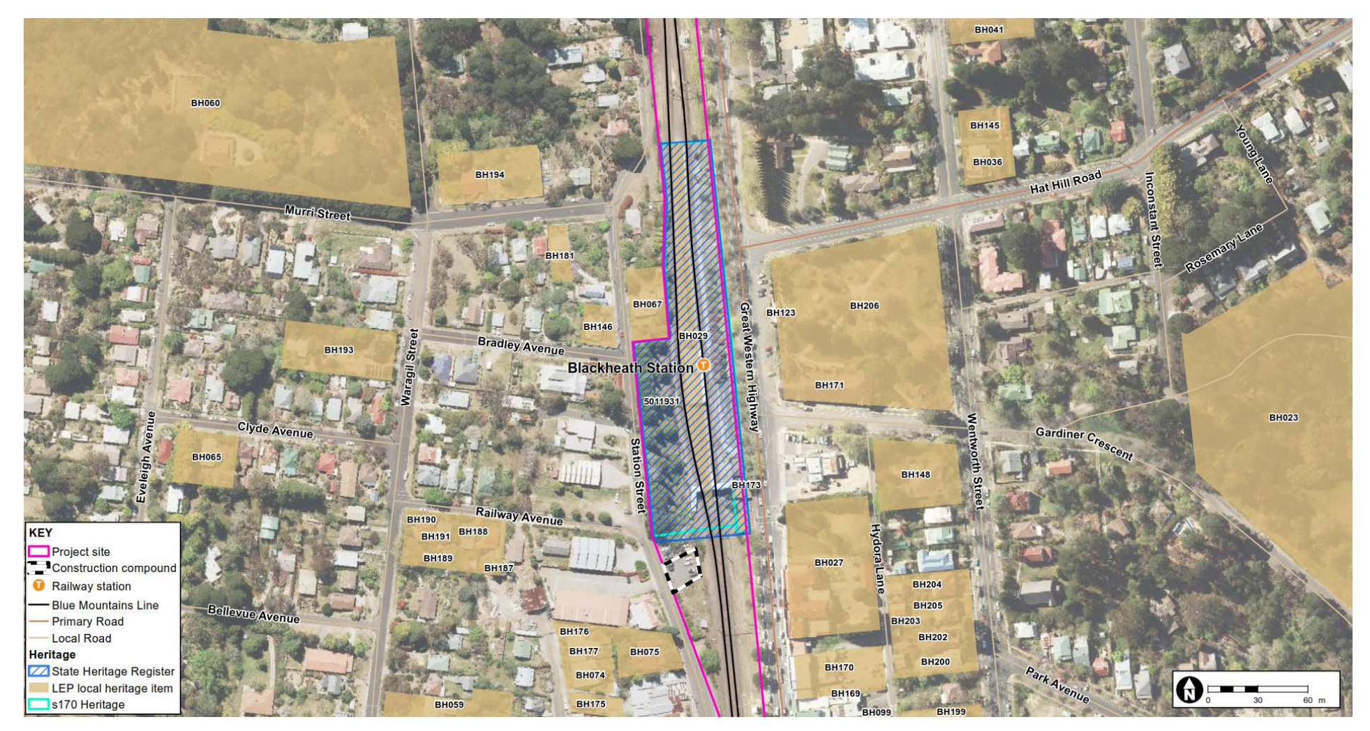
Figure 2 Heritage items within the vicinity of Blackheath Station