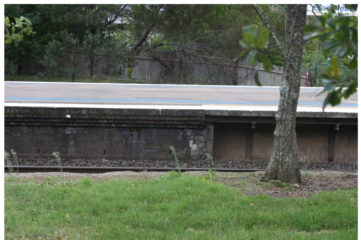
Figure 10 View (looking west) of junction between 1902 platform extension and 1955 platform extension (right of image)