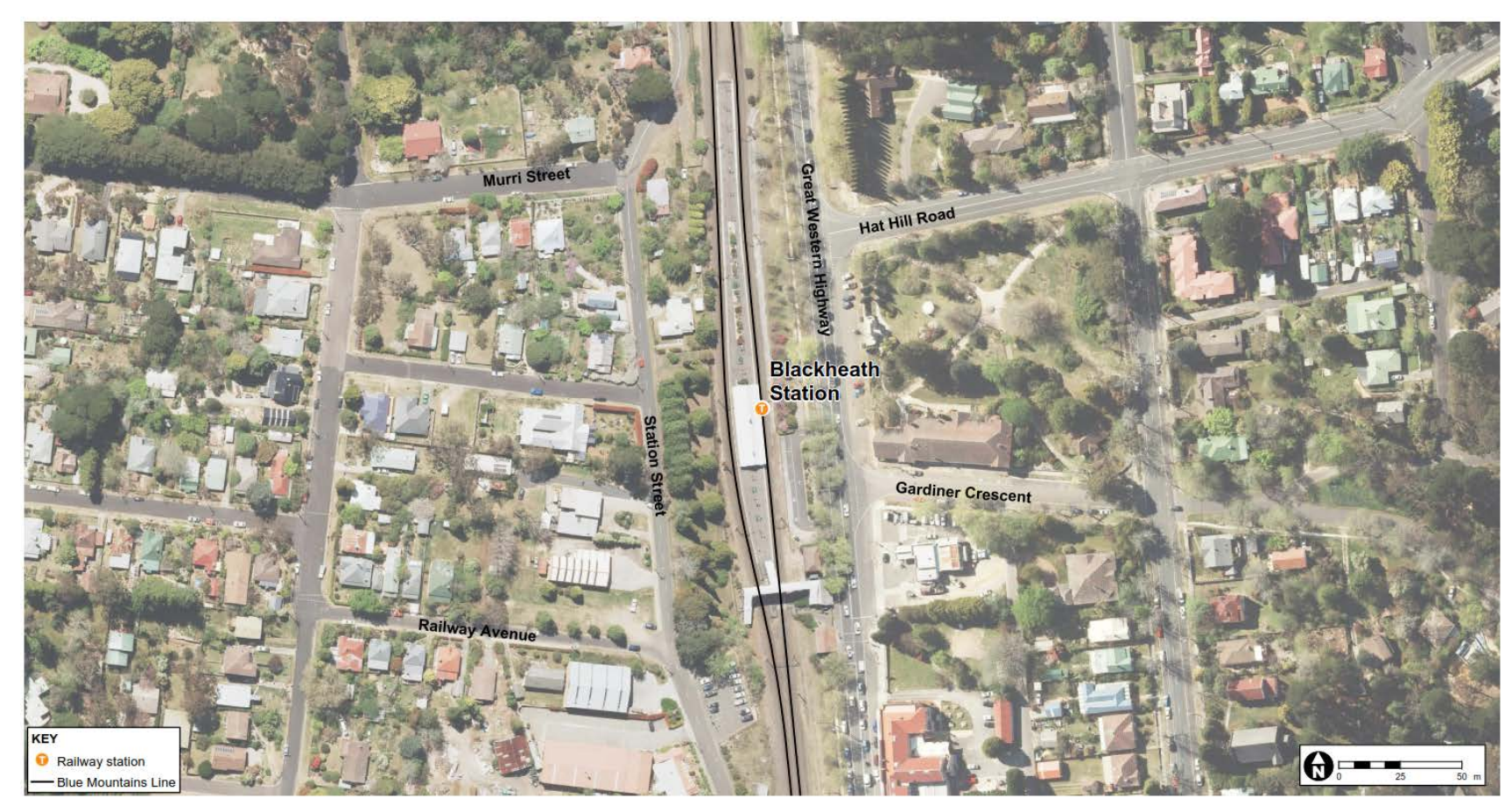
Figure 1 Location of Blackheath Station