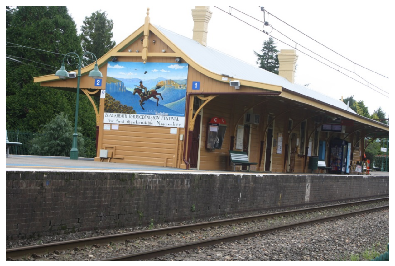
Figure 7 View north of 1898 section of platform 1 showing two courses of brick additions above the original