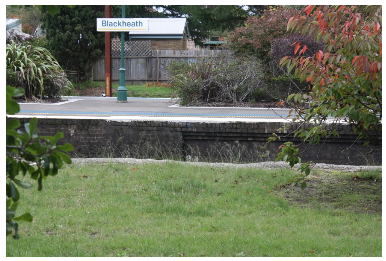
Figure 9 View (looking west) of junction between 1898 platform and 1902 platform extension (right of image)