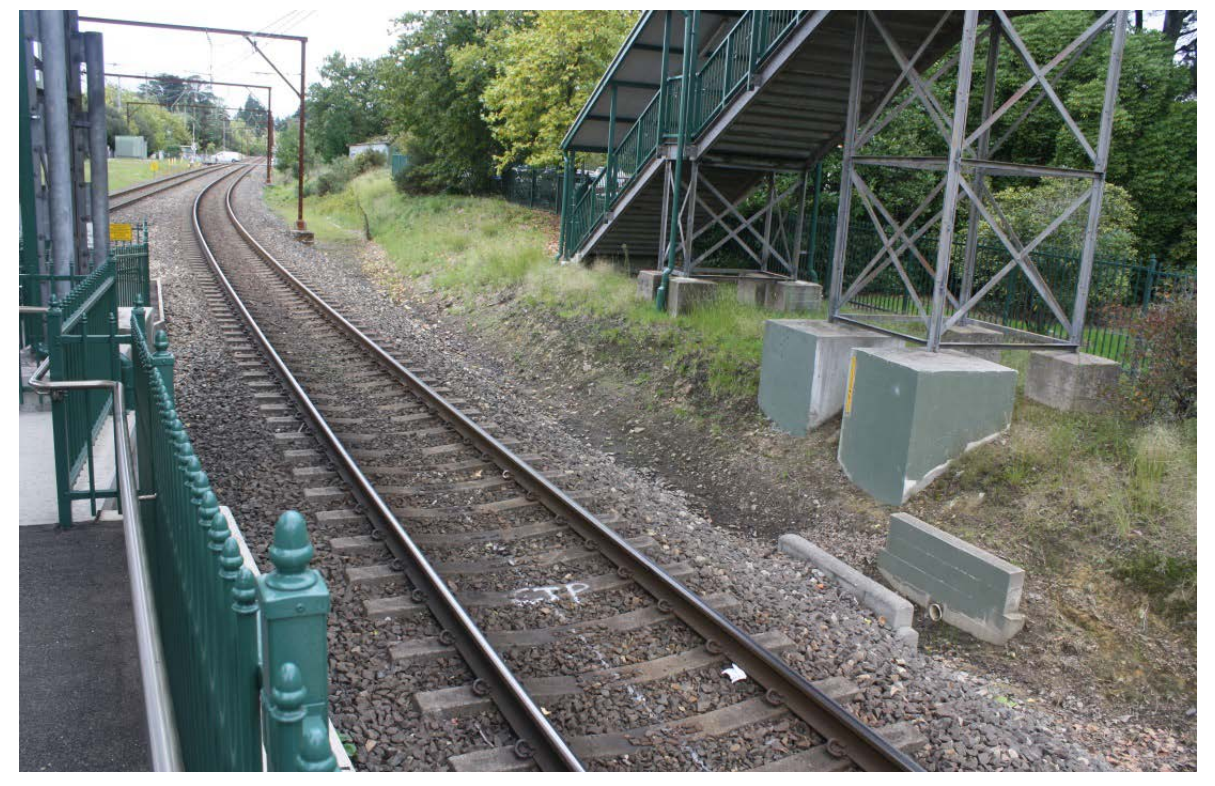
Figure 12 View south of tracks (platform 2). Note concrete sleepers

The track consists of sleepers, ballast and rail (Figure 12). It is noted that the sleepers are concrete throughout the Blackheath Station precinct, indicating they have been replaced as the initial construction of the line would have been on wooden sleepers. It is anticipated that these items are not individually or collectively significant, having undergone extensive modifications and replacements since the lines were laid in 1898.