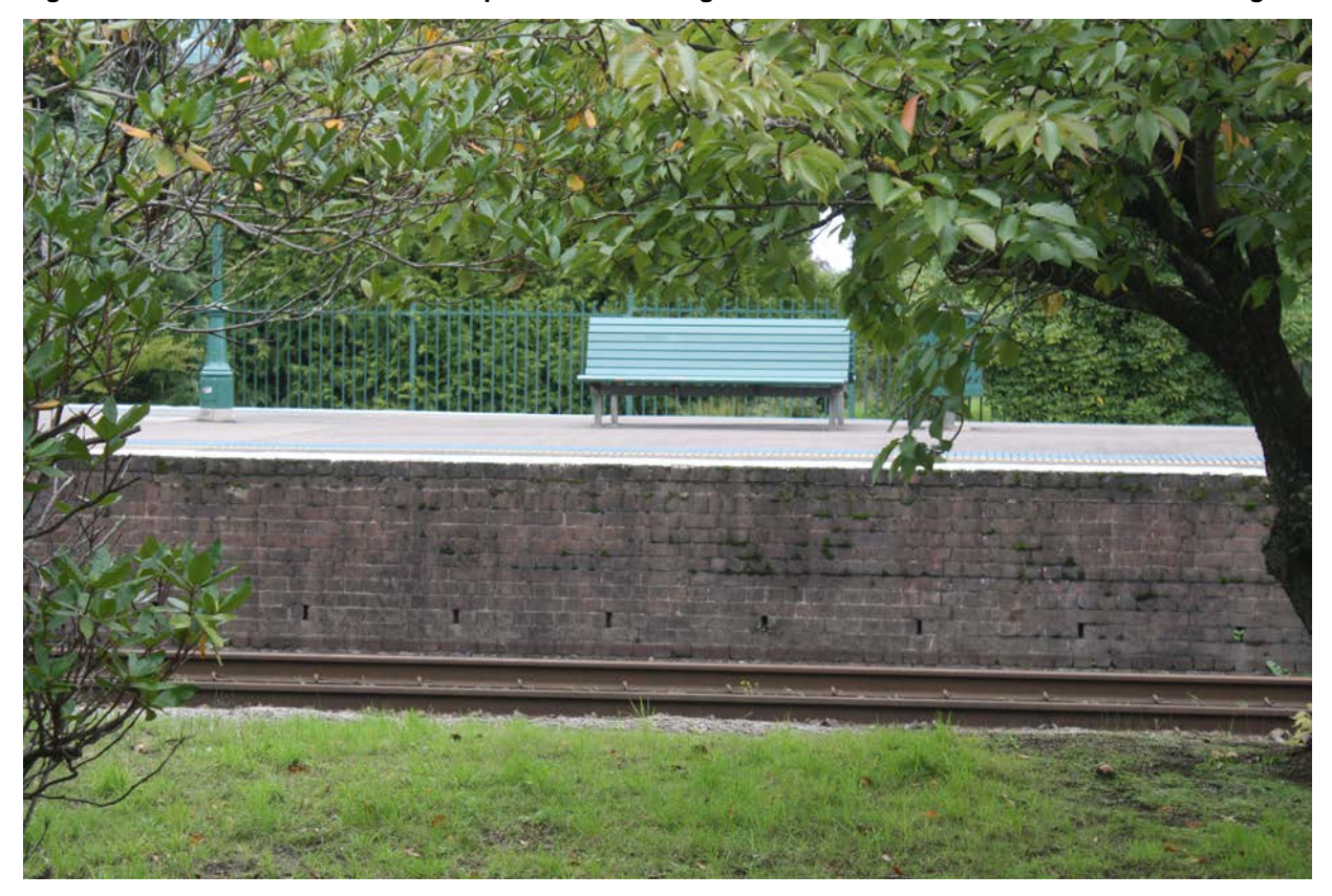
Figure 8 Profile of the original 1898 platform 1 coping (looking west)