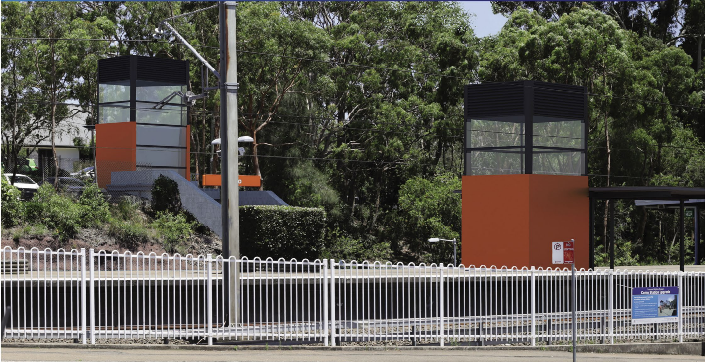
Artist's impression of the proposed upgrade, subject to detailed design.