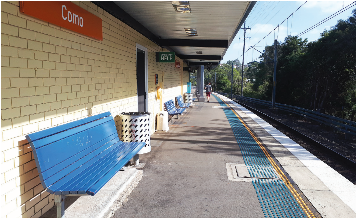
Como Station, March 2018.