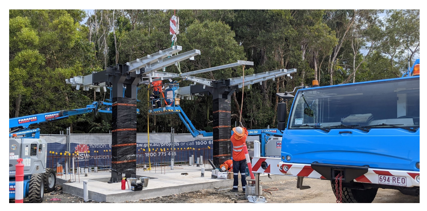
Amenities Block - Structural Steel Erection, October 2020.