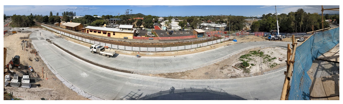
Image: Photograph of the Interchange construction site, October 2020.