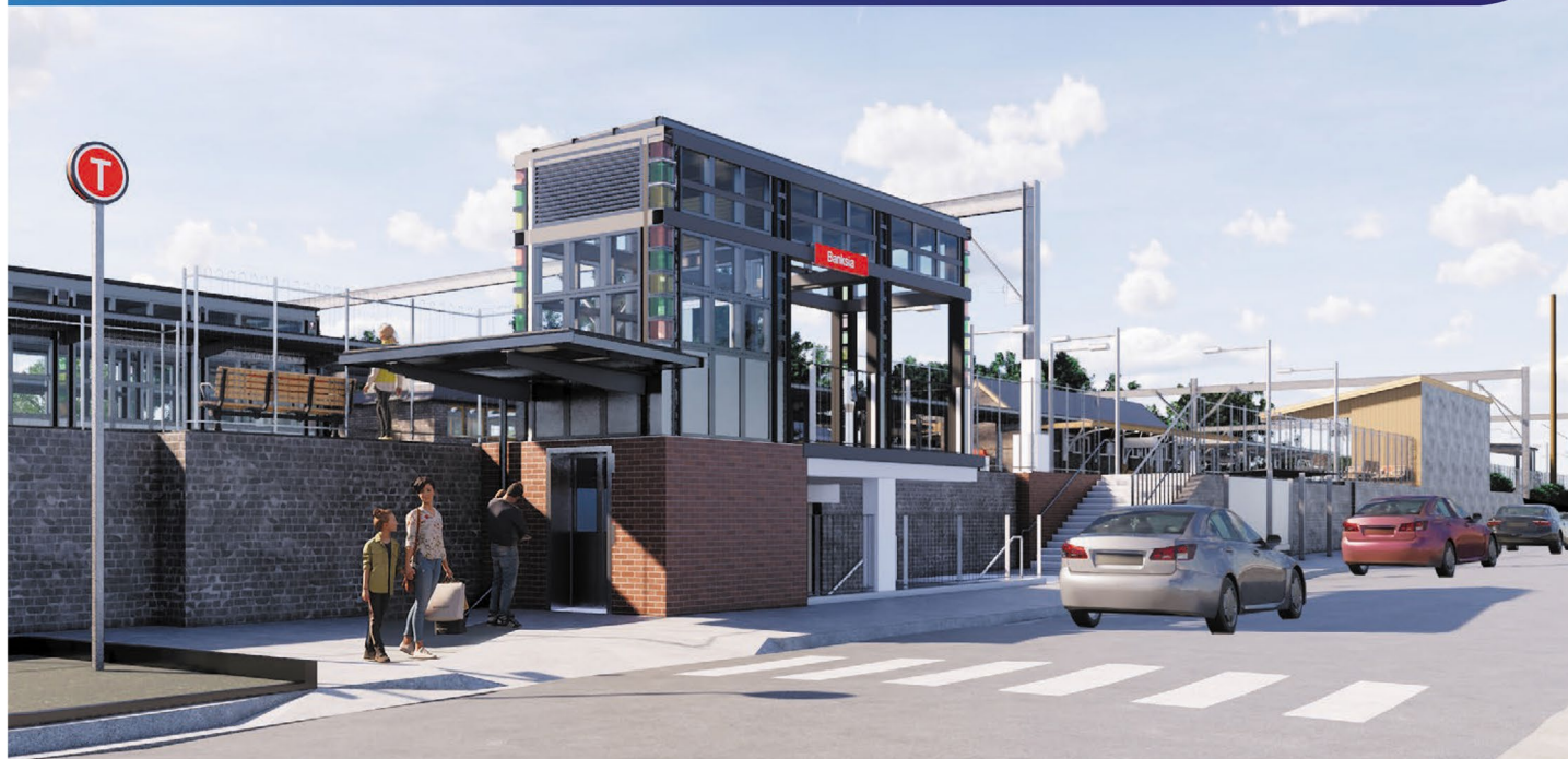
Artist's impression of the proposed Banksia Station Upgrade, subject to change during detailed design