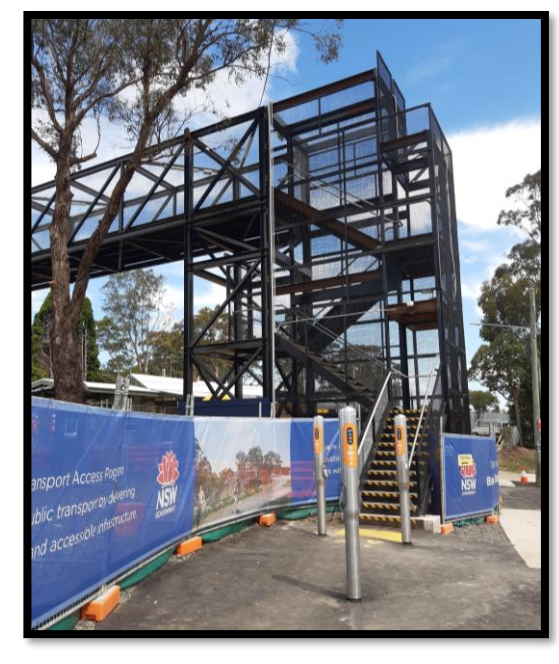
Customers can access Birrong Station using the temporary footbridge on Hudson Parade while the new station entry is being constructed