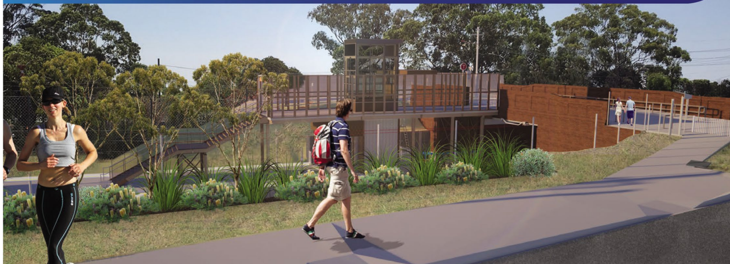
Artist's impression of the Birrong Station Upgrade, subject to change during detailed design