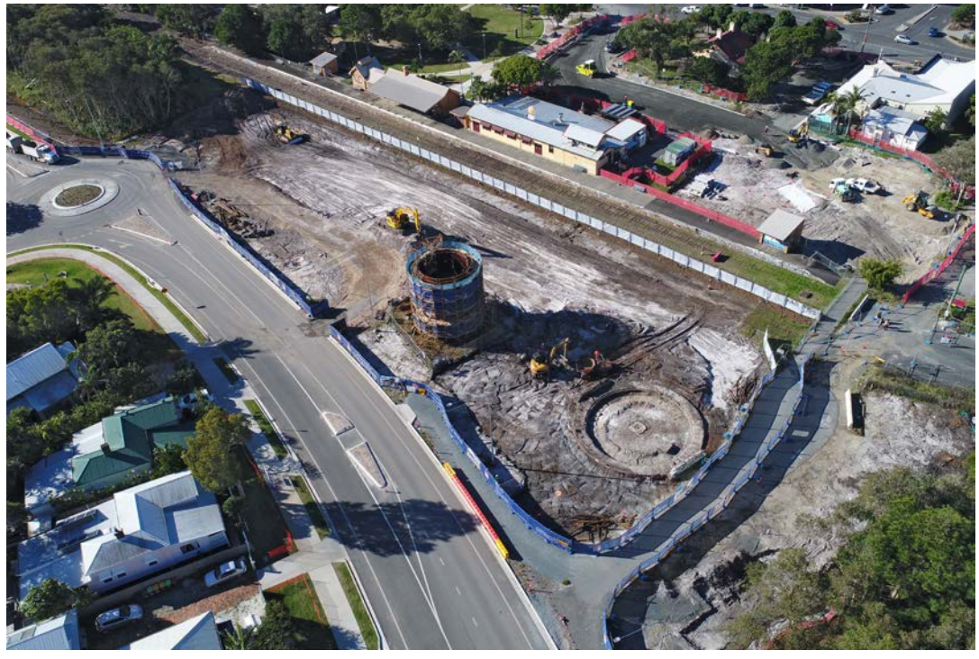
Bird's eye view of the Lawson Street South Car Park construction area, June 2020.