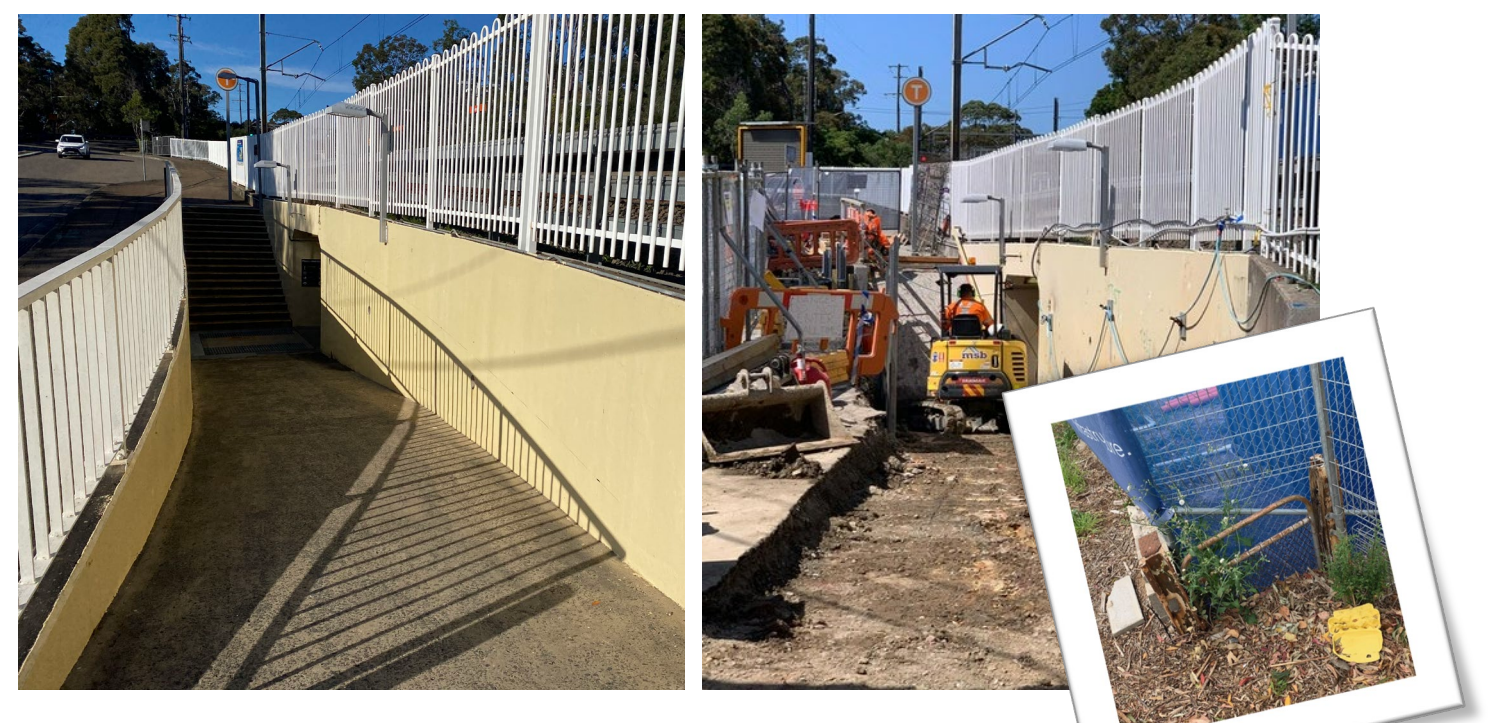
Railway Road ramp – before and during the upgrade work

Como Station Upgrade is part of the Transport Access Program, an initiative to provide a better experience for public transport customers by delivering modern, safe, and accessible infrastructure. The upgrade will provide a station that is accessible to those with a disability, limited mobility, carers/parents with prams and customers with luggage.