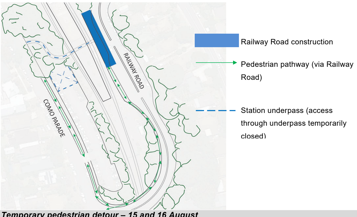
Temporary pedestrian detour – 15 and 16 August

For information about rail replacement buses during trackwork, please visit transportnsw.info or phone 131 500.