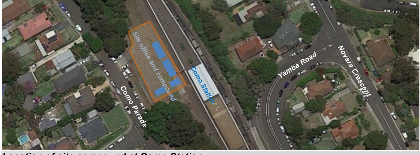
Location of site compound at Como Station.

Work to establish the site compound will involve the use of a 55-tonne crane, various construction vehicles and hand tools. This compound will be located on the Como Parade side of the station within the rail corridor, as indicated by the image below.