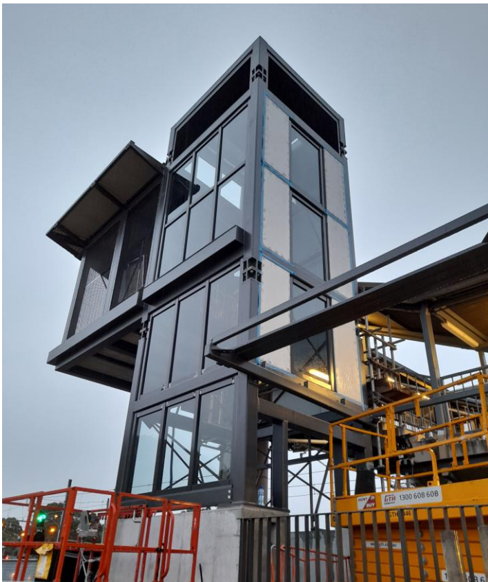
Pictured left: The new lift shaft on Platform 2 at Canley Vale Station being installed

Transport for NSW is improving accessibility at Canley Vale Station. The upgrade will provide a station precinct that is accessible to people with a disability or limited mobility, parents/carers with prams, and customers with luggage.