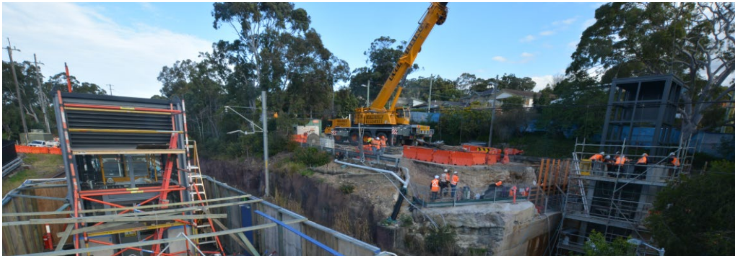
Installation of the Como Parade lift was successful in the month of June.

Transport for NSW is upgrading Como Station to make it easier for everyone to access, including people with a disability or limited mobility, parents/carers with prams, and customers with luggage.