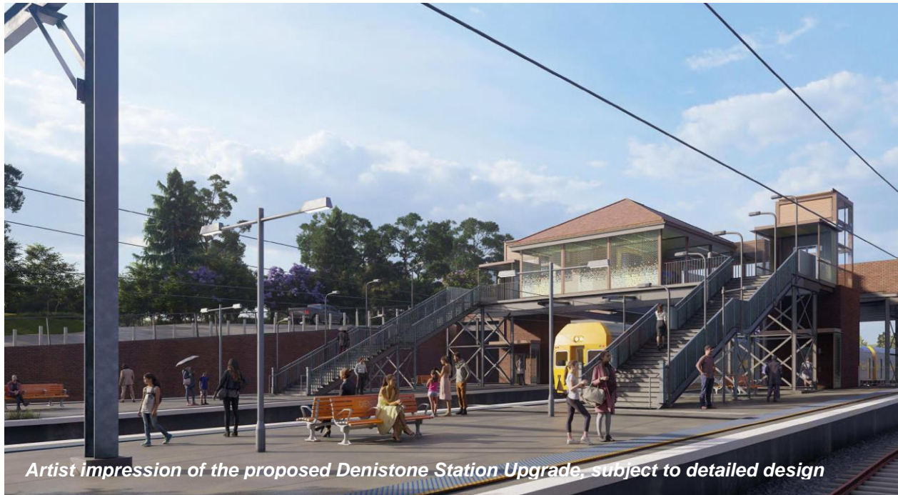
Artist impression of the proposed Denistone Station Upgrade, subject to detailed design