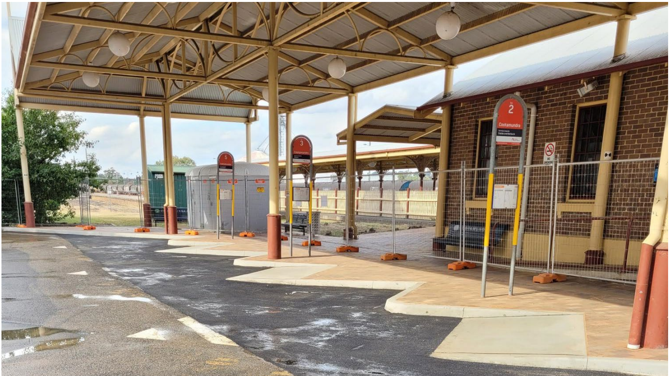
Pictured: Regrading and resurfacing of the Cootamundra Station bus zone

The NSW Government is improving accessibility at Cootamundra Station. This upgrade is being delivered as part of the Transport Access Program, an initiative to provide a better experience for public transport customers by delivering modern, safe, and accessible infrastructure.