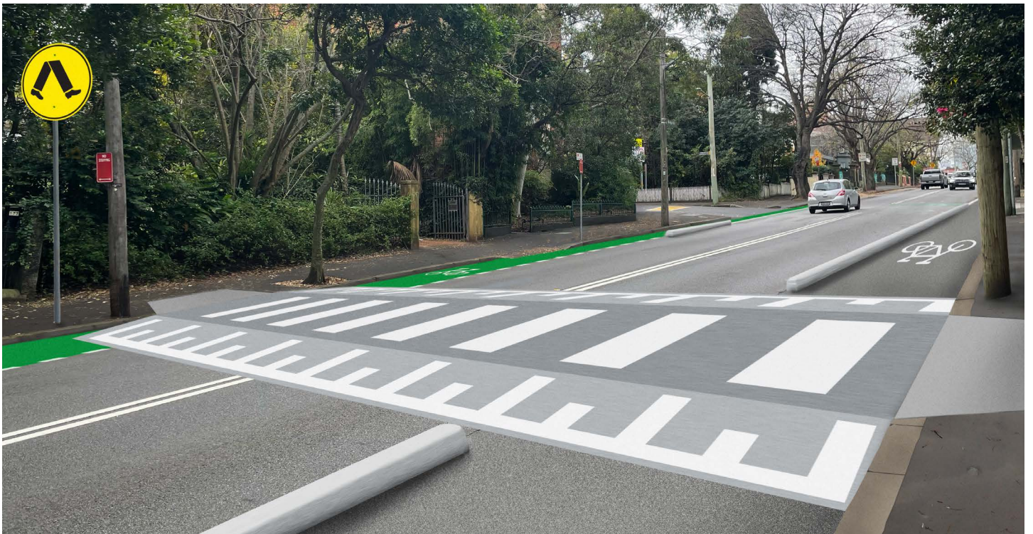
Indicative render (subject to change) facing east on Bridge Road between Clare Street and Woolley Street, showing one of two new proposed crossings for people walking. The green paint on the cycleway indicates driveways and side roads and gaps in the cycleway barrier enable access to them.