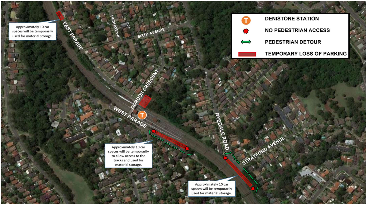
Pedestrian detours and temporarily affected on-street parking.

The public carpark at Gordon Crescent and Kinson Crescent will be temporarily closed from Friday 9 June until Thursday 15 June 2023 to store equipment and materials for the trackwork weekend.