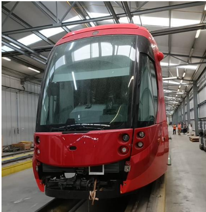
PLR LRV01 at Trenasa (Wheel un-loading testing)Ziordia Storage Facility