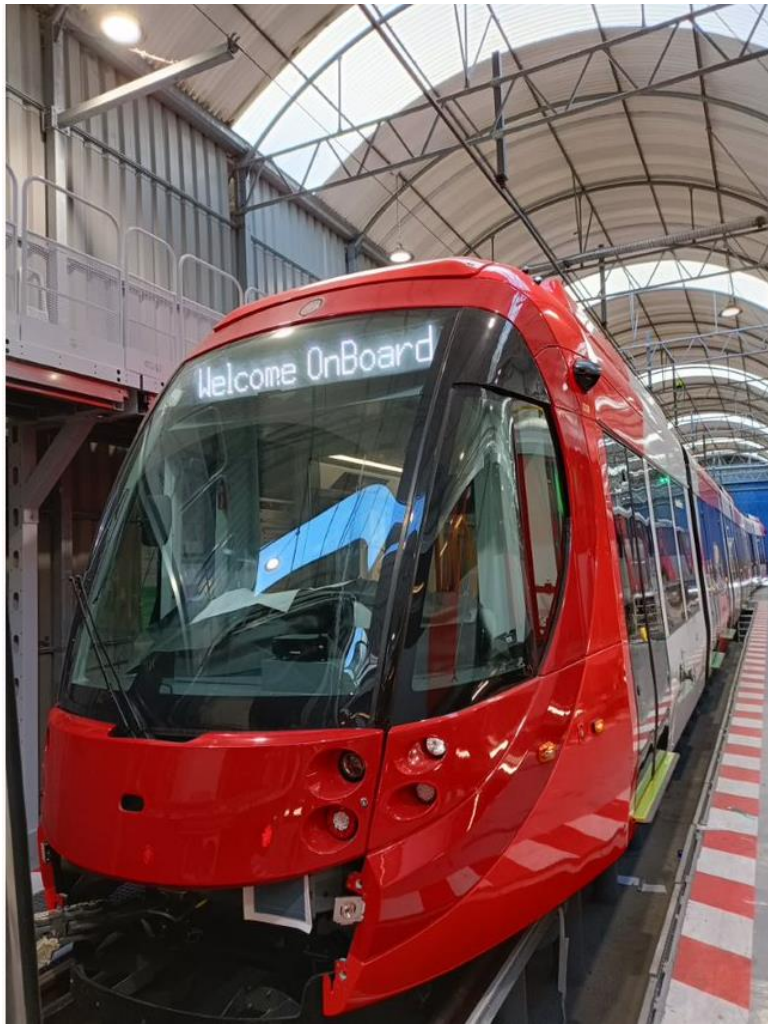
PLR LRV01 – Final inspection and fit-out prior to shipment