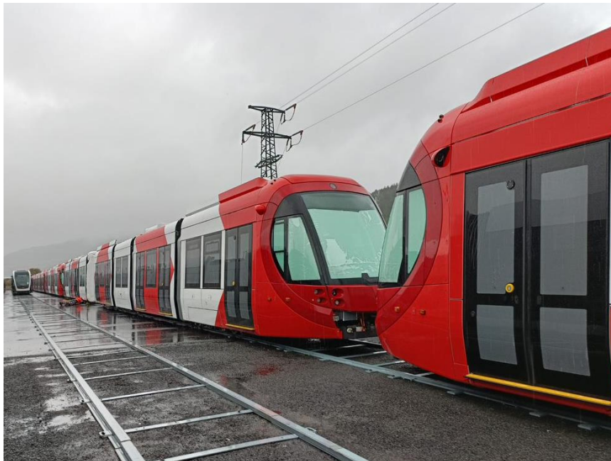
PLR fleet in storage at Ziordia