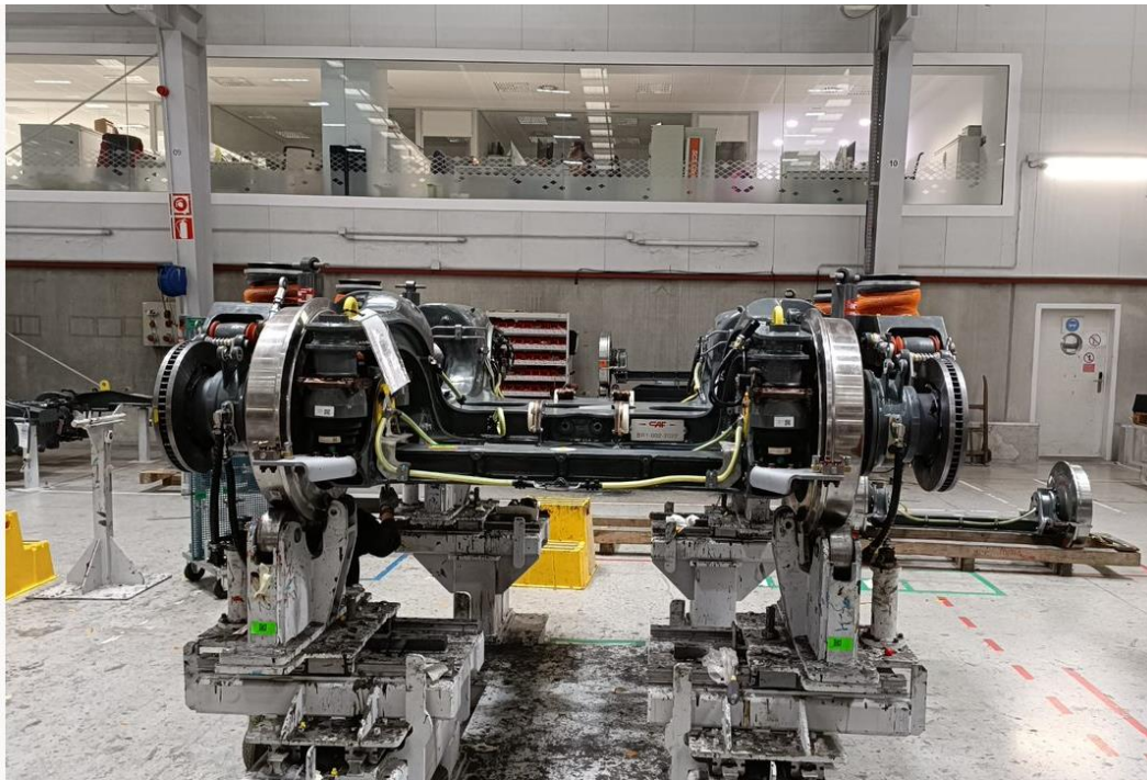
IWL Expansion Bogie article inspection