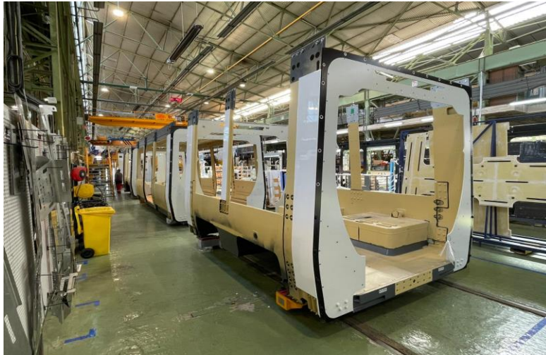
IWLR Expansion LRV03 in Production