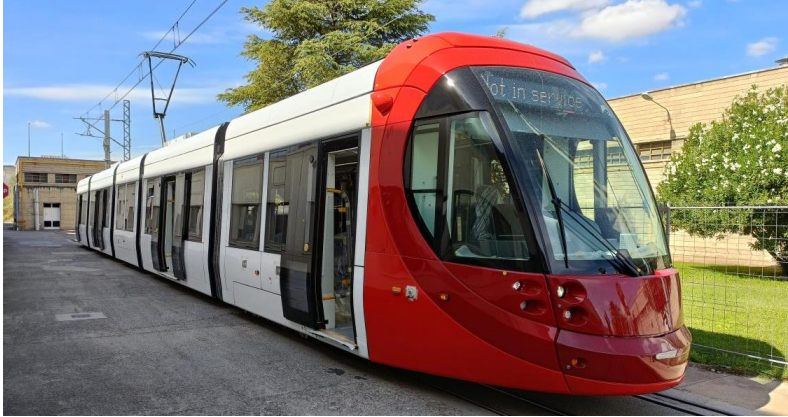
IWLR Expansion LRV01 on Test Track