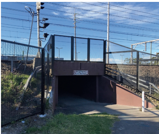
New fence at the Coniston pedestrian subway

Over the next 10 years the More Trains, More Services program will simplify and modernise the rail network so that customers can expect more frequent train services, with less wait times, less crowding and more seats on a simpler, more reliable network.