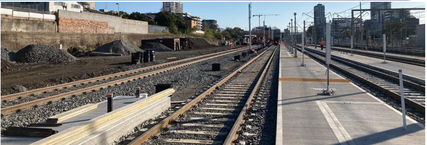
Photo taken inside the rail corridor - August 2021, showing the new drivers' walkway and stockpiled materials for trackwork