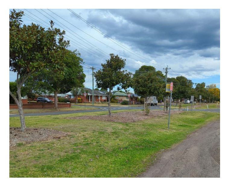
Bus stop at Warring Avenue, Emu Plains

We are also proposing to install a pedestrian refuge in this location, to improve safety for pedestrians crossing the road.