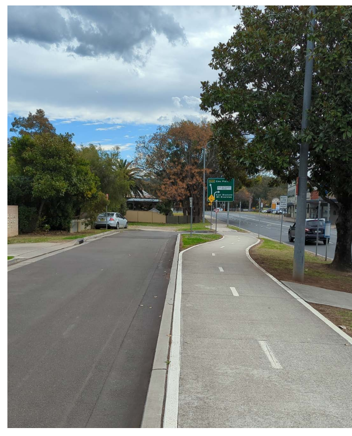
Service road extension at Billington Place and Great Western Highway, Emu Plains

Temporary traffic restrictions such as lane closures and lower speed limits will be put in place for the safety of road users and our workers.